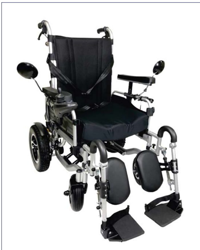
Battery Operated Wheel Chair for the person affected with Muscular Dystrophy and Spinal Cord Injury