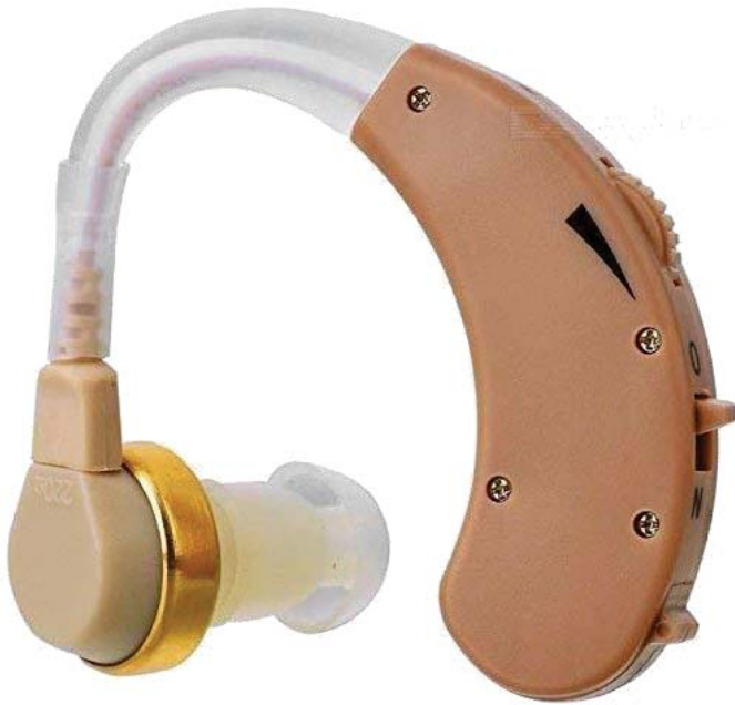
Behind the Ear Hearing Aid