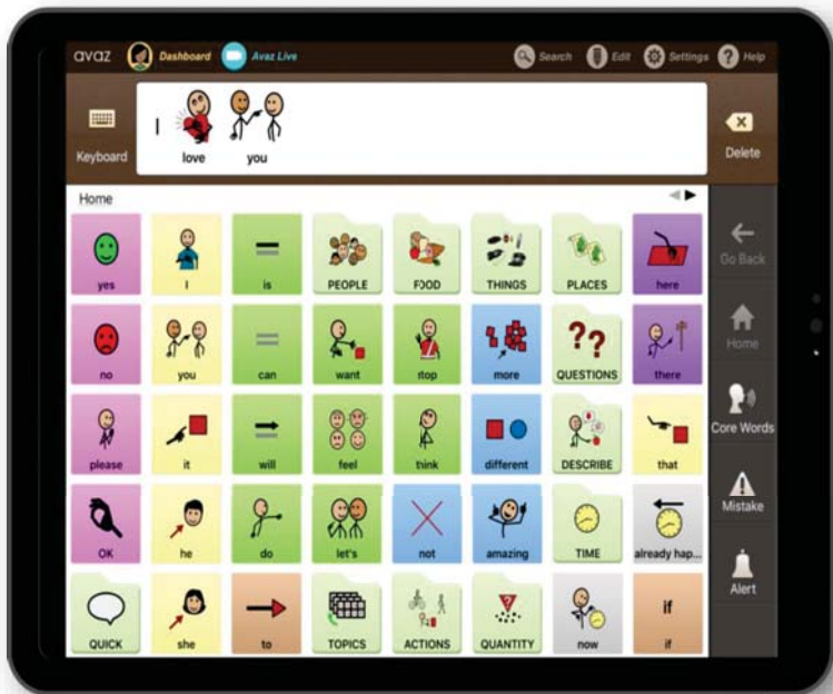
Augmentative and Alternative Communication System (Aac) Device with Avaz Software