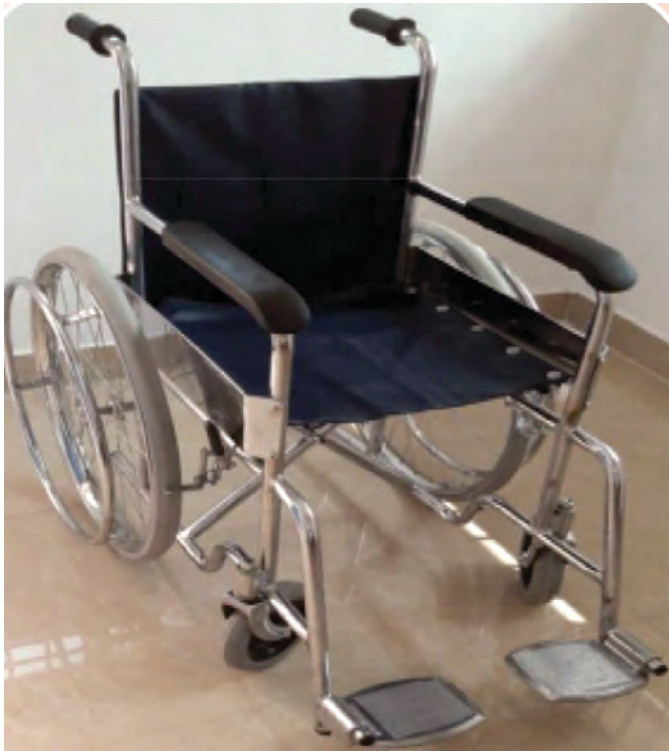
Foldable Wheel Chair