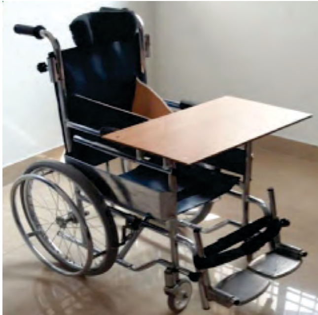
Special Wheel Chair for persons affected with Cerebral Palsy