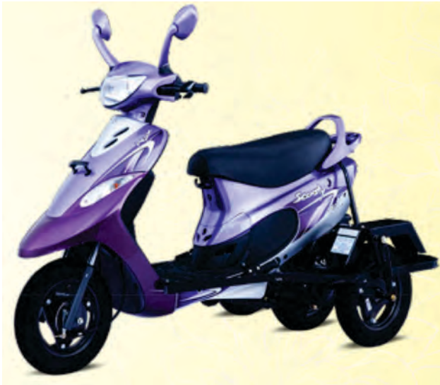
Retrofitted Petrol Scooter