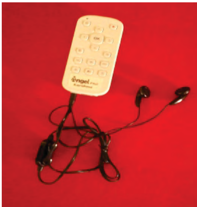
Angel Pro Daisy Digital Player