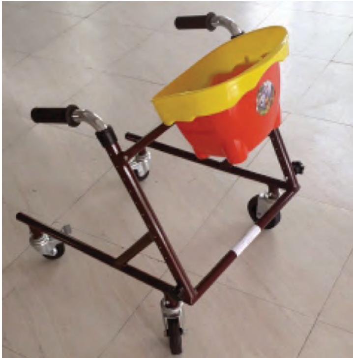
Walking Device for Children