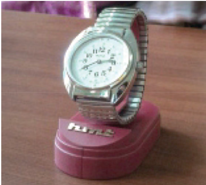
Braille Watch for Visually Challenged