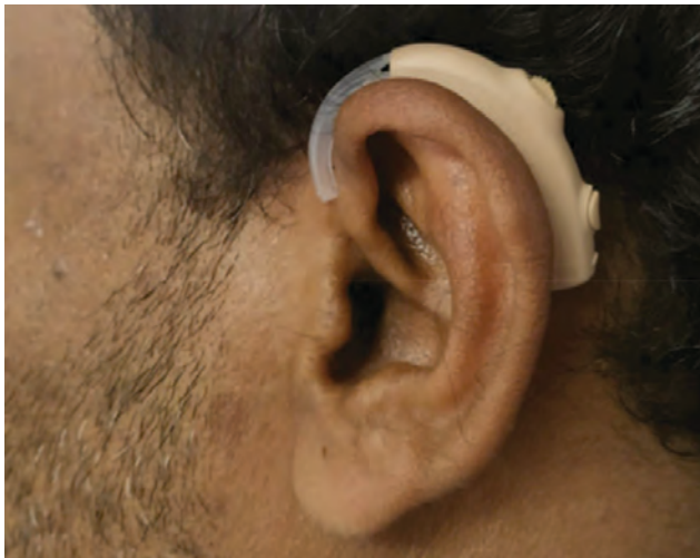
Behind the Ear Hearing Aid