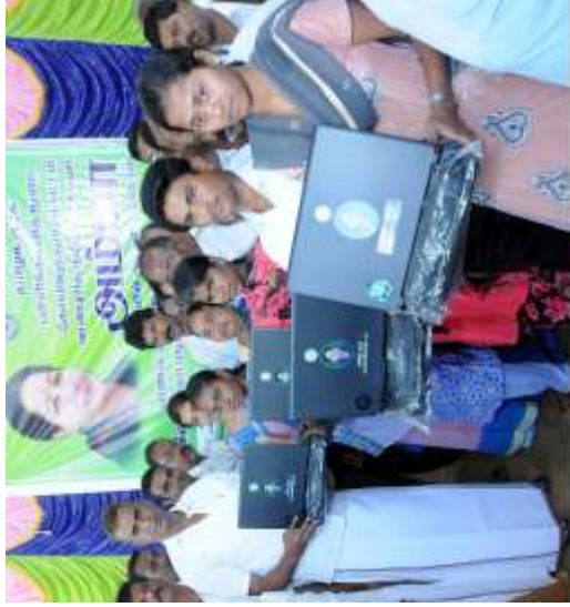
Distribution of free of cost Laptop Computers to Students Coimbatore District