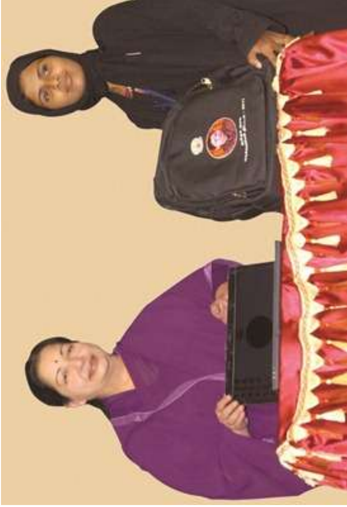
Hon'ble Chief Minister of Tamil Nadu distributed free of cost Laptop Computers to Students – Trichy District