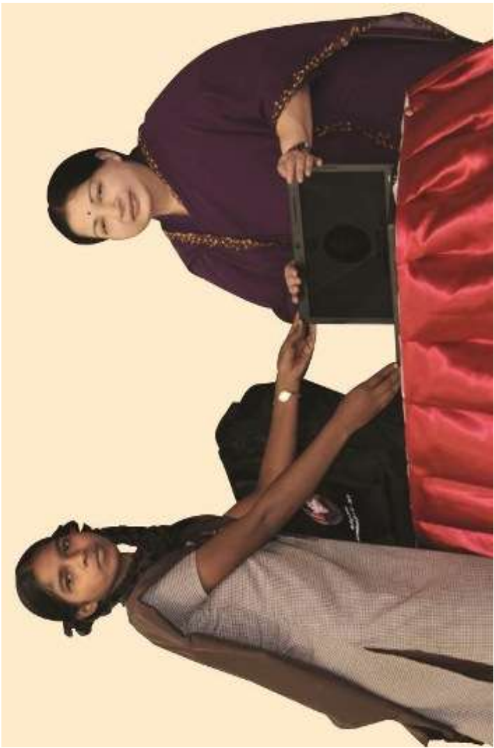
Hon'ble Chief Minister of Tamil Nadu distributed free of cost Laptop Computers to Students – Tiruvallur District