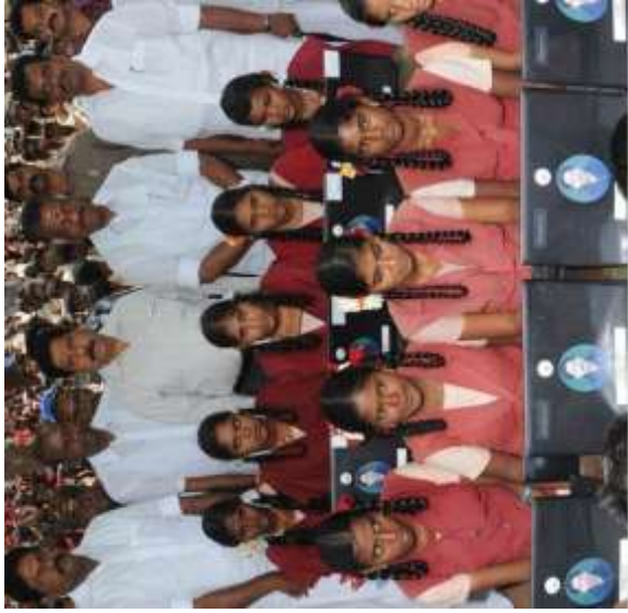
Distribution of free of cost Laptop Computers to Students Theni District