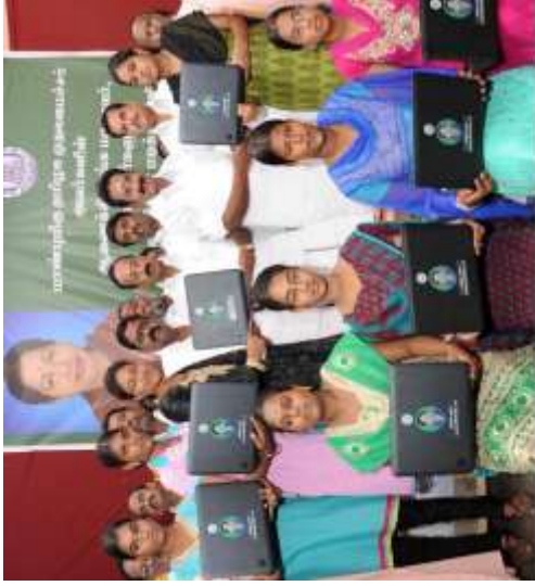
Distribution of free of cost Laptop Computers to Students