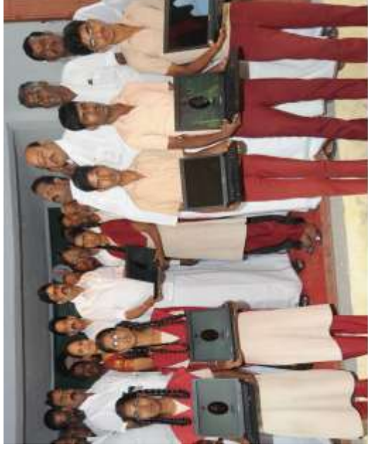
Distribution of free of cost Laptop Computers to Students Virudhunagar District