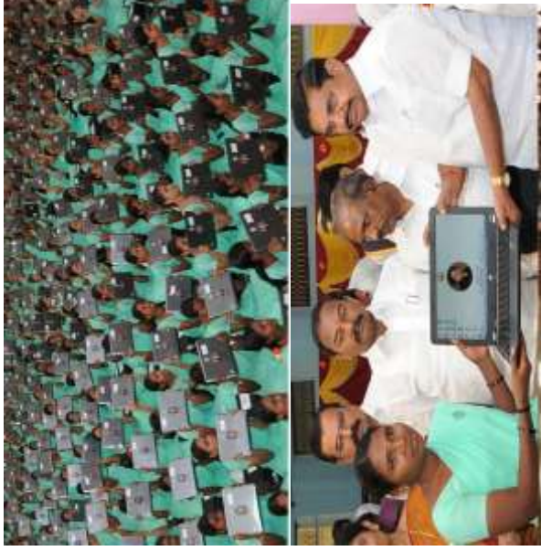
Distribution of free of cost Laptop Computers to Students Salem District