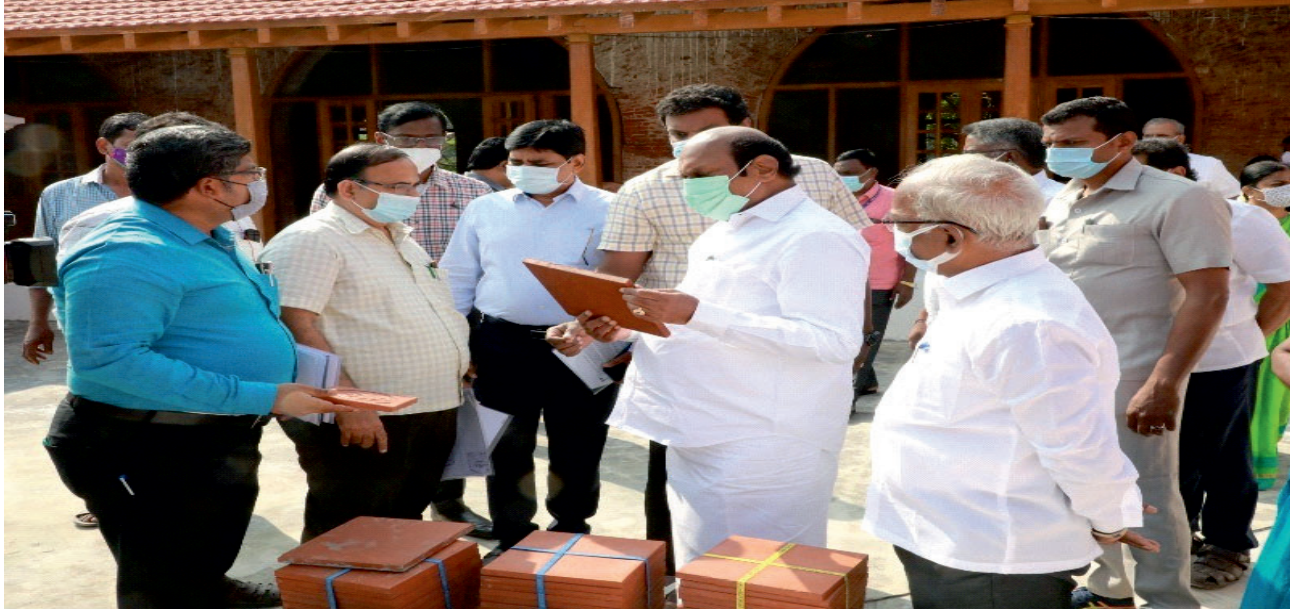
Inspection was carried out by the Hon'ble Minister for Public Works at the site of Fire affected and distressed 'Humayun Mahal ' Heritage Building Renovation Work at Chepauk in Chennai