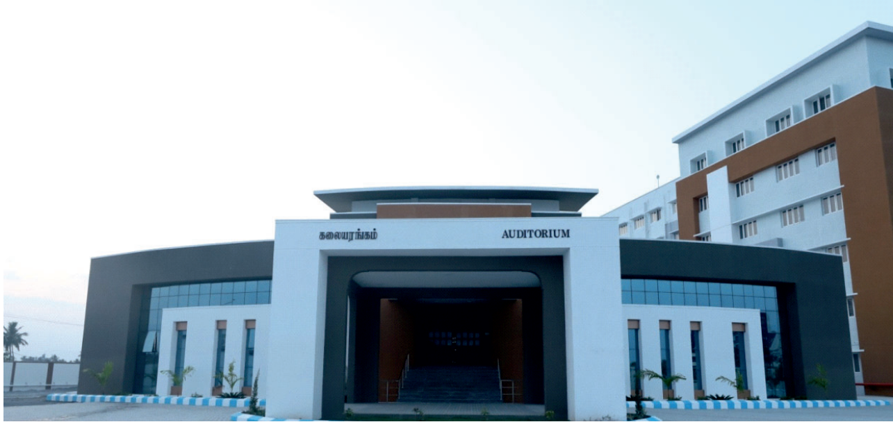
Kallakurichi Government Medical College – Auditorium Inaugurated on 12.01.2022