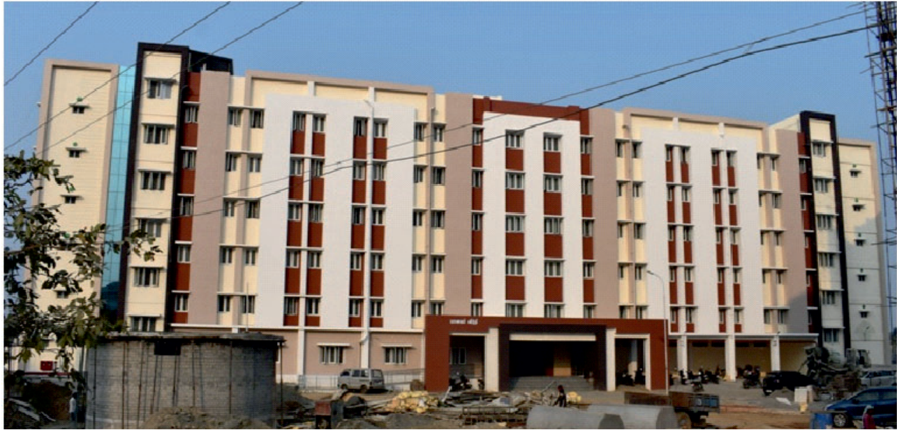
Kallakurichi Government Medical College –Student Hostel (Boys) Inaugurated on : 12.01.2022