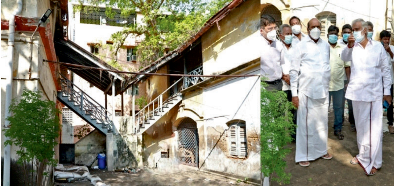
Inspection was carried out by the Hon'ble Minister for Public Works at Registrar Office at the Sowcarpet, Davidson Road, Chennai