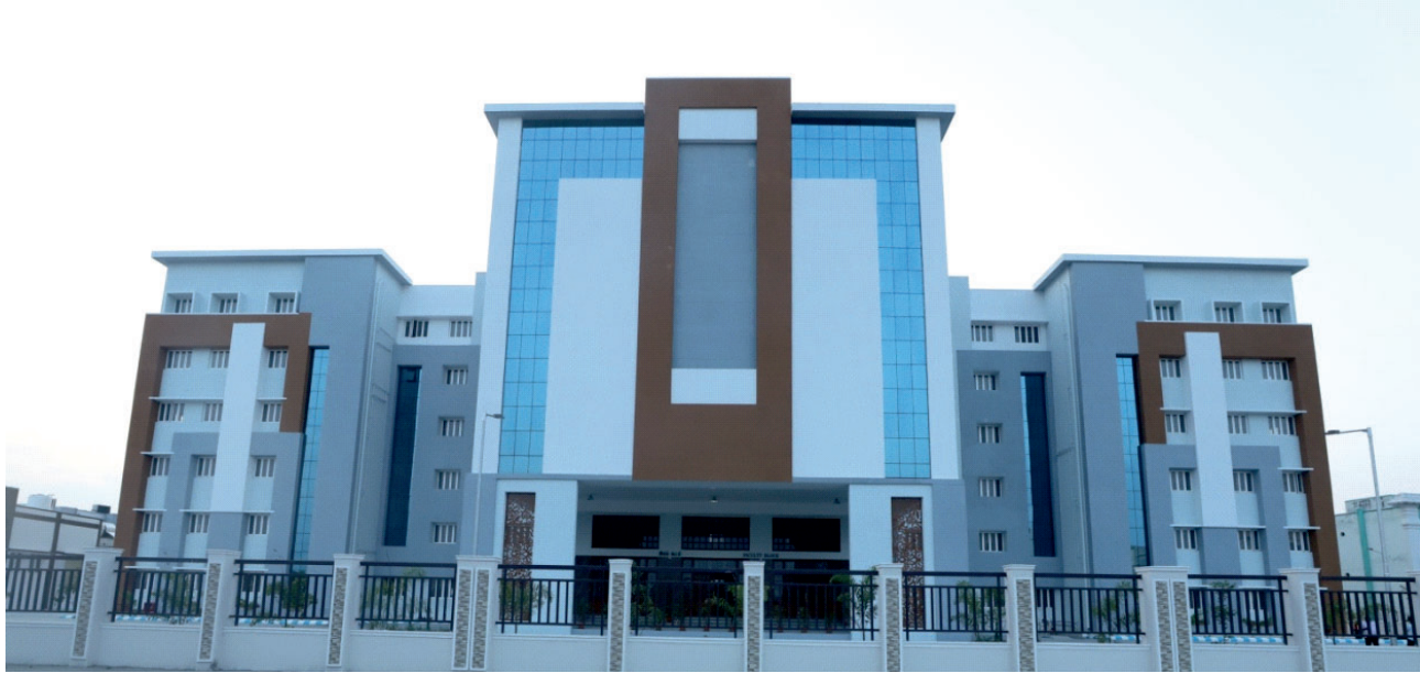
Kallakurichi Government Medical College – Institution Inaugurated on : 12.01.2022