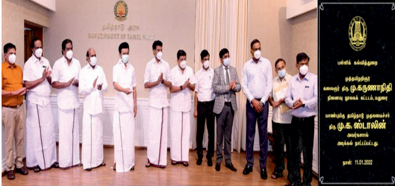
The foundation was laid for the Kalaingar Memorial Library , Madurai on 11.01.2022 by the Hon'ble Chief Minister of Tamil Nadu Thiru.M.K.Stalin through Video Conferencing at Secretariat