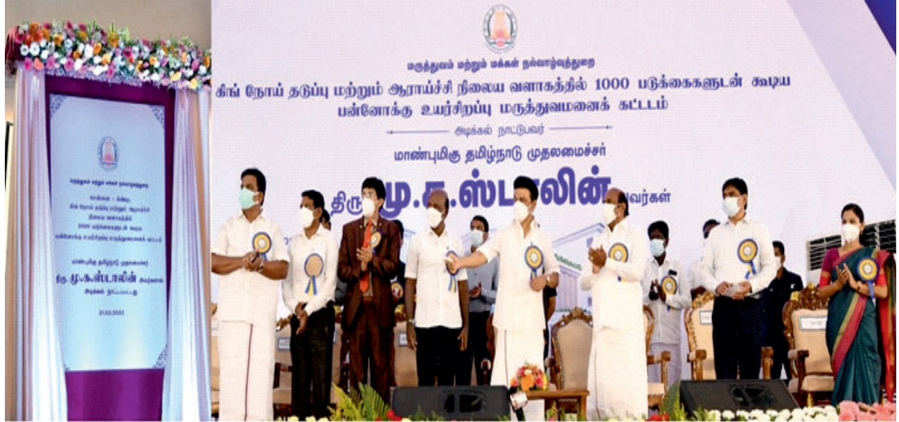
The foundation was laid for the Multi Super Speciality Hospital , Guindy, Chennai at an estimated cost of Rs.230 Crore in the premises of Kings Institute of Preventive Health & Medicine on 21.03.2022 by the Hon'ble Chief Minister of Tamil Nadu Thiru.M.K.Stalin through Video Conferencing.