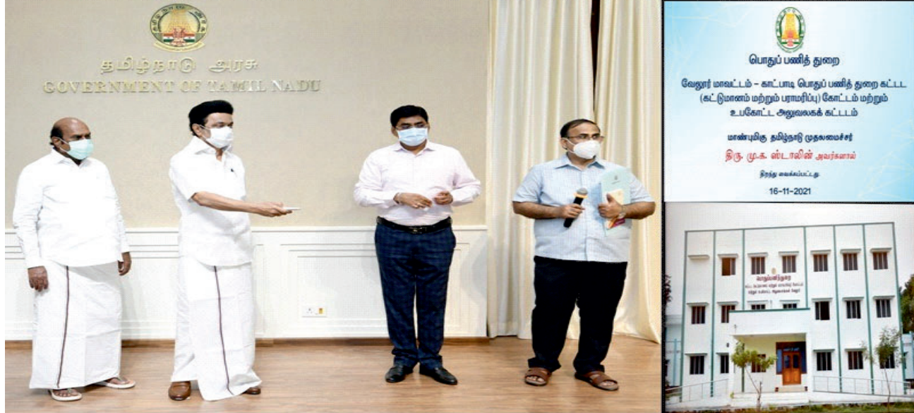
The Office of Public Works Department Buildings (Construction & Maintenance) Division and Sub Division at Katpadi, Vellore was inaugurated on 16.11.2021 by the Hon'ble Tamil Nadu Chief Minister Thiru.M.K.Stalin through Video Conferencing at Secretariat