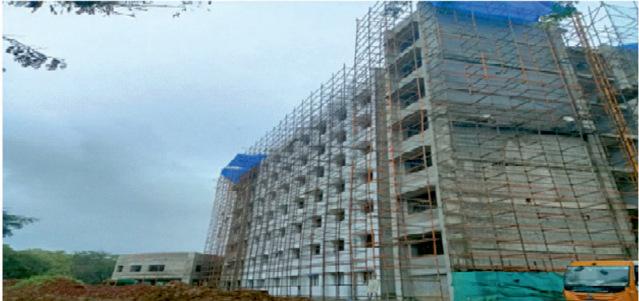
Construction of District Collectorate in Tirupathur