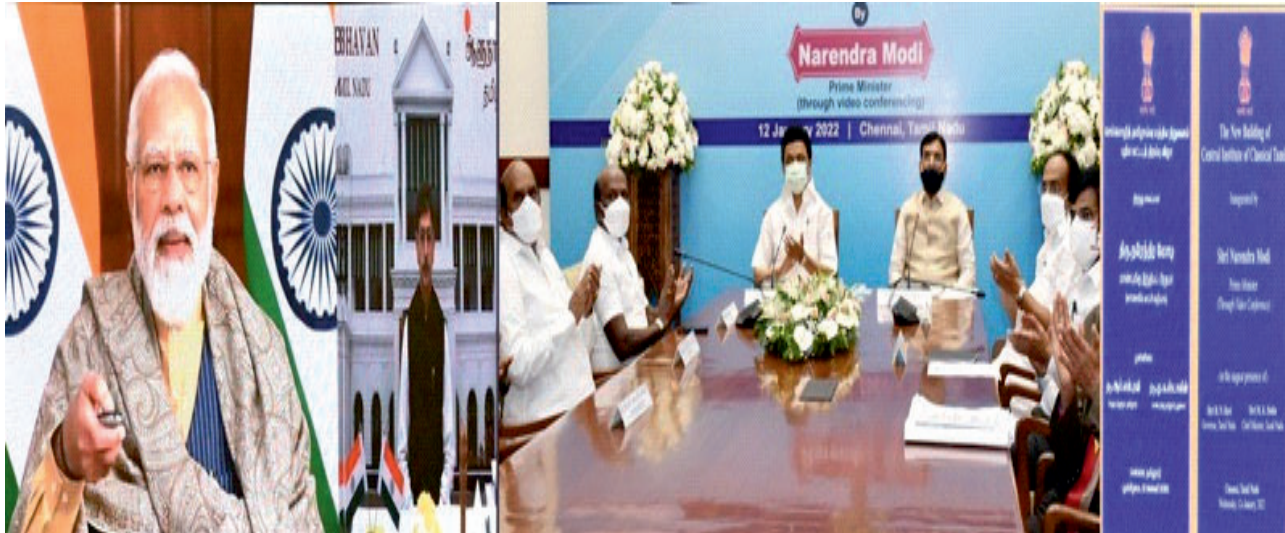
Newly constructed 11 New Medical Colleges at a cost of Rs.4080 Crore was inaugurated by the Hon'ble Prime Minister of India in the presence of the Hon'ble Chief Minister of Tamil Nadu through Video Conferencing at New Delhi