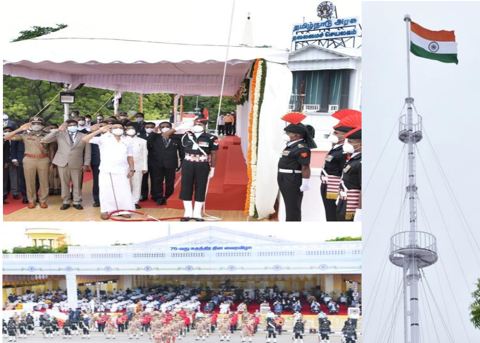
Hon'ble Chief Minister hoisted the National Flag on 75th Independence Day celebration. Grand arrangements made by Public Works Department