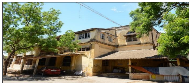
Governor Bungalow, Coimbatore (Old Forest Office)

Renovation of Heritage Buildings being undertaken by Public Works Department