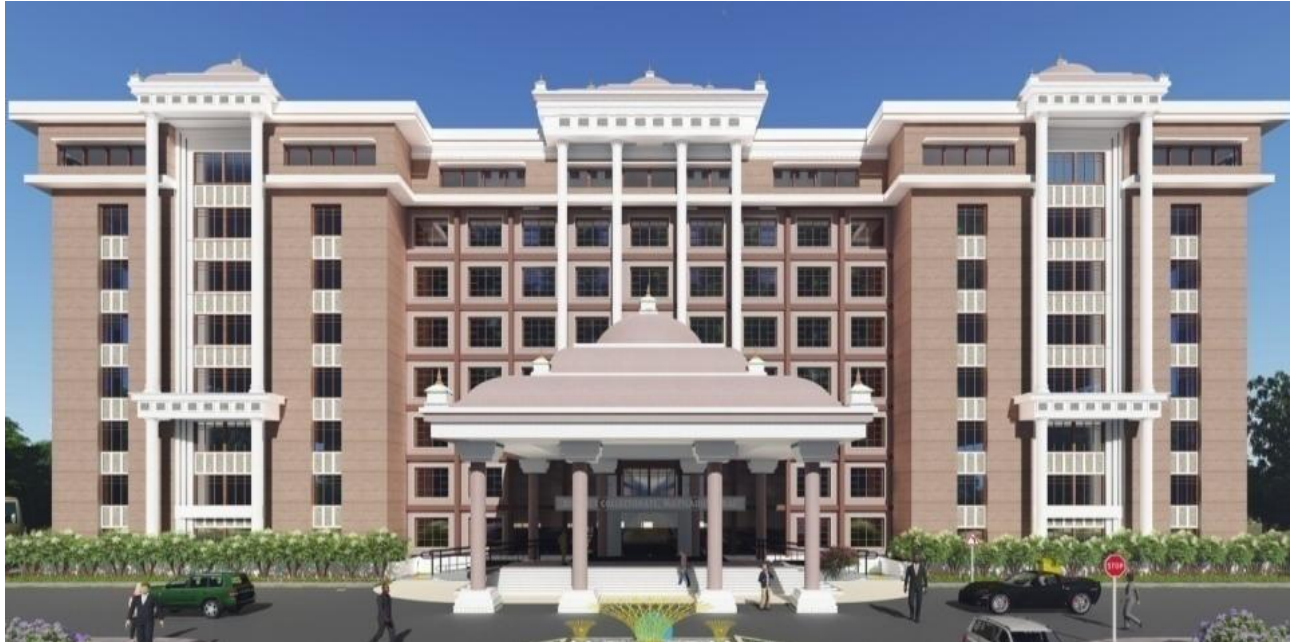
Collectorate Building at Mayiladuthurai – Front Elevation view Work to be takenup