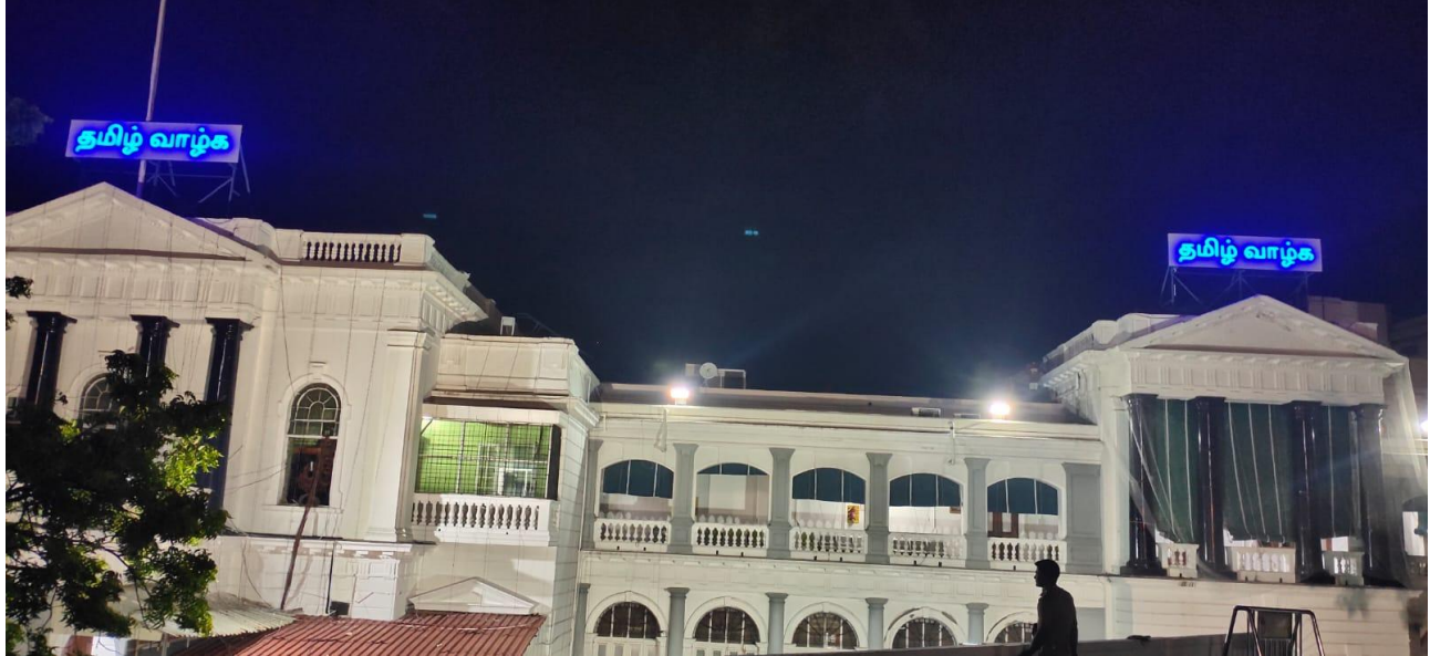
“தமிழ் வாழ்க” New Neon Name boards installed on top of Tamil Nadu Assembly Building during the Centenary Celebrations of the Tamil Nadu Legislature