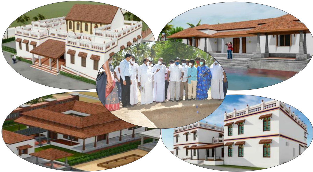
Hon'ble Minister for Public Works inspected the Archaeological Museum building works at KEEZHADI in Sivagangai District along with Hon'ble Ministers on 26.06.2021.