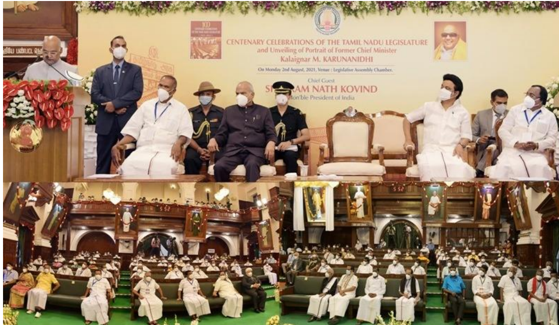
Hon'ble President of India addressing as Chief Guest during the Centenary Celebrations of the Tamil Nadu Legislature on 02.08.2021 at Tamil Nadu Legislative Assembly Chamber