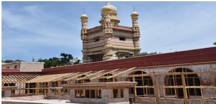
Humayun Mahal, Chepauk, Chennai