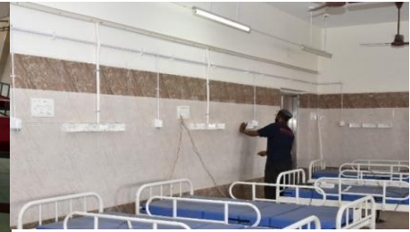
Additional beds with Medical Oxygen facilities at Government Hospital, Ponneri

Works for CORONA Preventive Measures undertaken by Public Works Department in short span of time