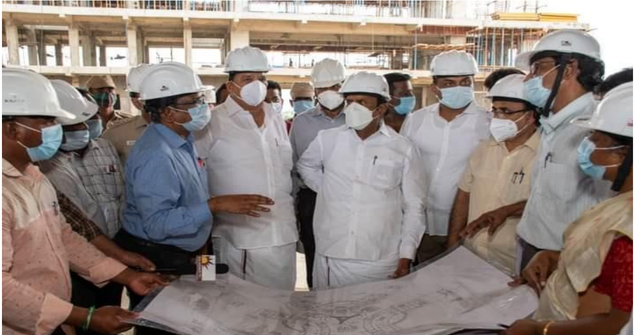
Inspection of the work progress at Ranipet Collectorate Building by Hon'ble Minister for Public Works along with Hon'ble Minister for Handlooms and Textiles on 14.07.2021