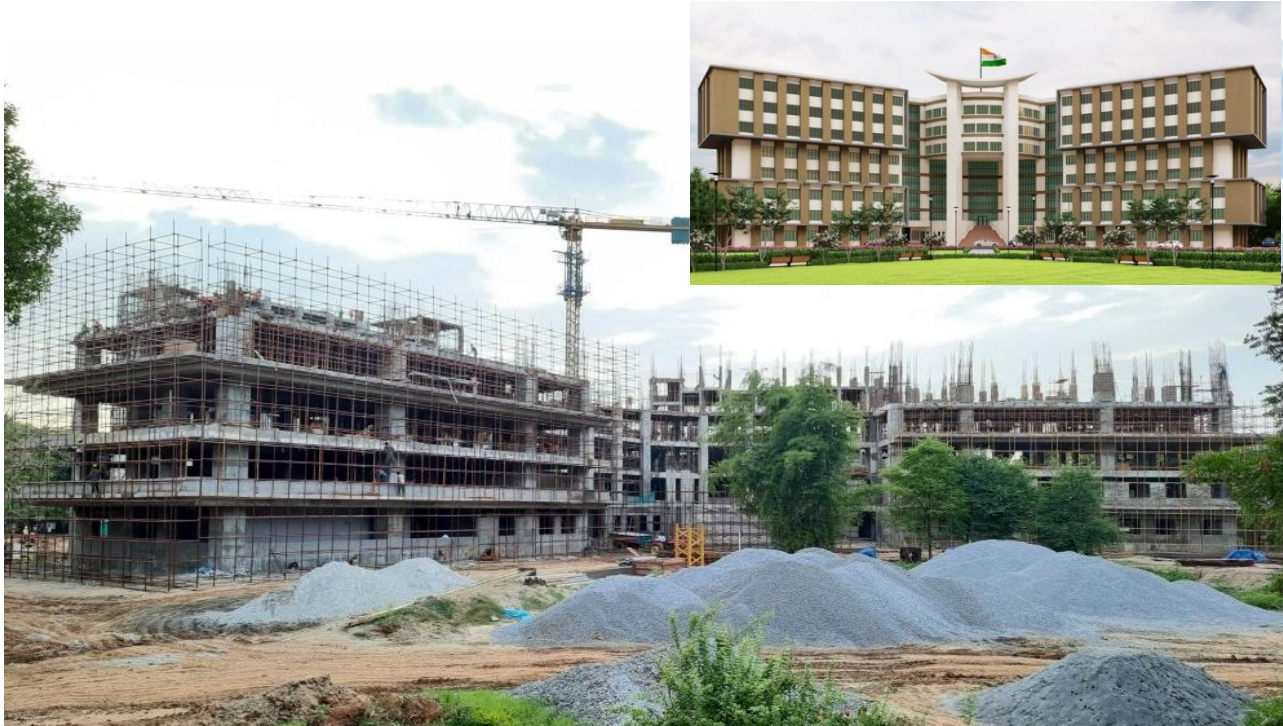
Collectorate Building under construction at Thirupathur