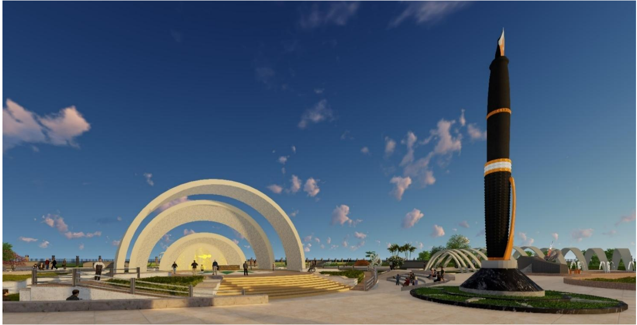
Artistic view of Muthamizh Arignar Kalaignar Memorial at Kamarajar Salai, Chennai announced by Hon'ble Chief Minister under Rule 110 of Legislative Assembly on 24.08.2021