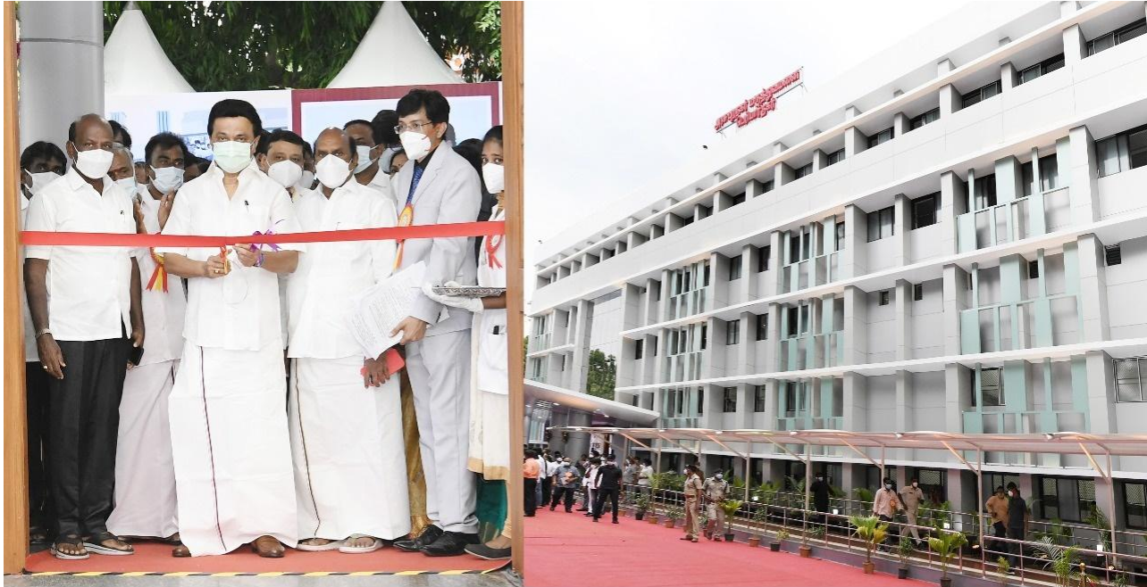
Hon'ble Chief Minister inaugurated the Upgraded Government Peripheral Hospital at Periyar Nagar, Kolathur Constituency, Chennai on 13.08.2021