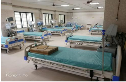
Additional Bed facilities at Rajiv Gandhi Government General Hospital