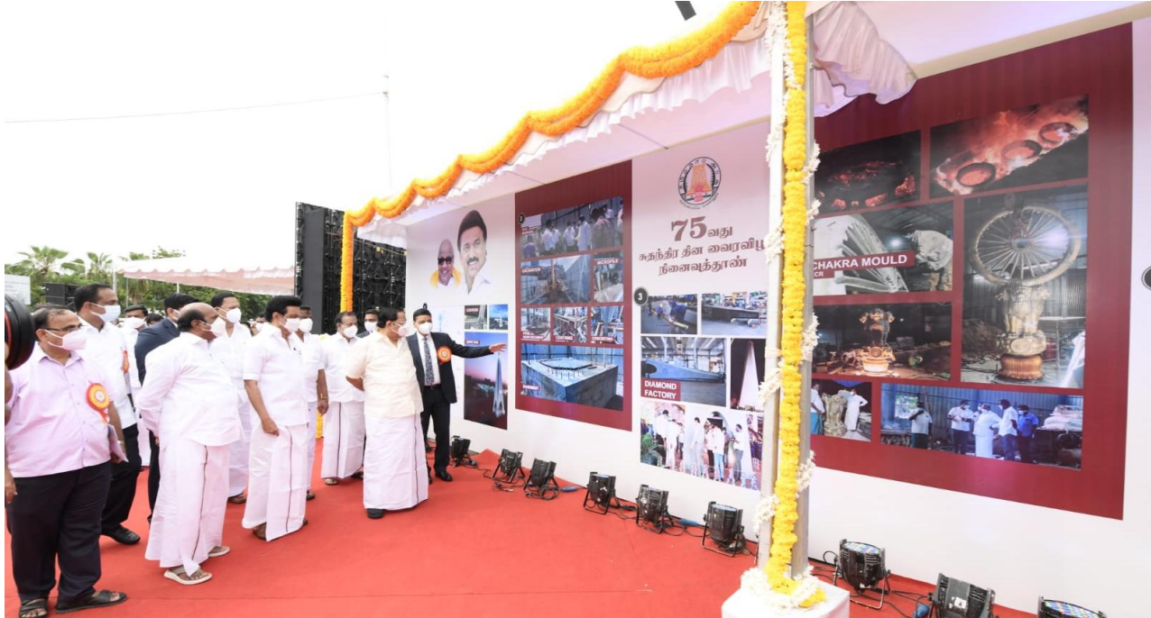
Hon'ble Chief Minister unveiled the 75th Year of Independence of India Commemoration Pillar at Chennai on 15.08.2021 and viewing the Photo Gallery