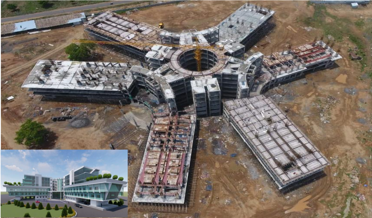
Collectorate Building under construction at Chengalpattu