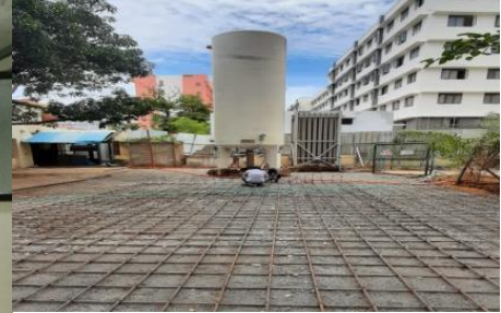
Medical Oxygen facilities at Government Stanely Hospital, Chennai