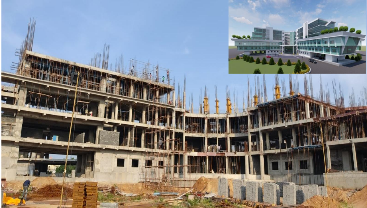
Collectorate Building under construction at Ranipet