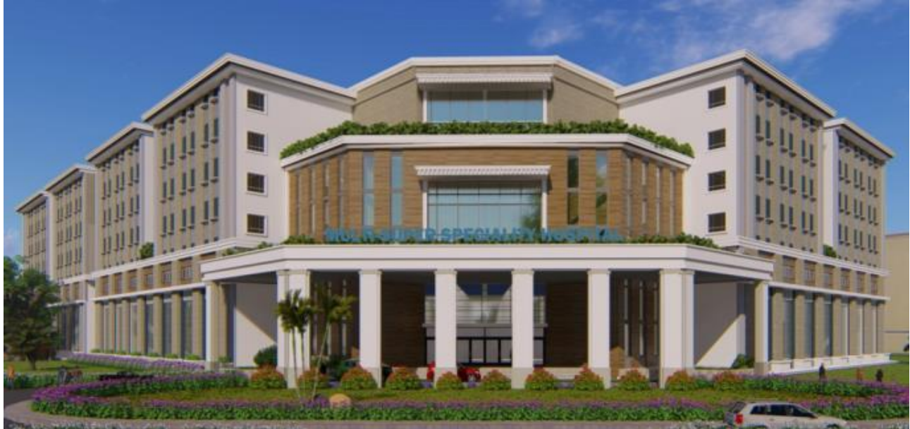
Front elevation view of Multi Super Speciality Hospital Building at King Institute, Guindy, Chennai announced by Hon'ble Chief Minister on 03.06.2021