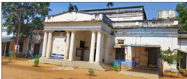
Old Collectorate Building, Trichy (Rani Mangammal Palace)