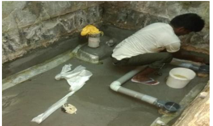
Water Supply & Toilet facilities at ESI Hospital, Combatore