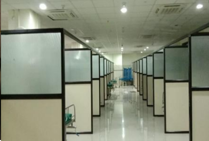
Isolation Ward at Omandurar Government Medical College, Chennai