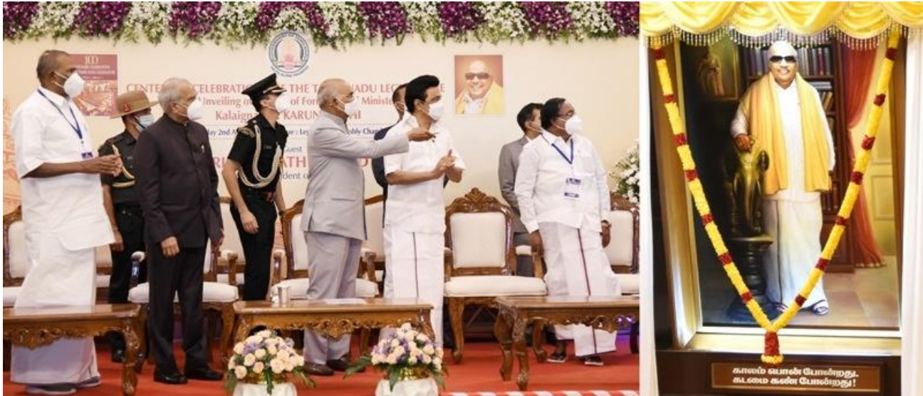
Portrait of Kalaingar M. Karunanidhi, Former Chief Minister unveiled by Hon'ble President of India on 02.08.2021 in Tamil Nadu Legislative Assembly Chamber