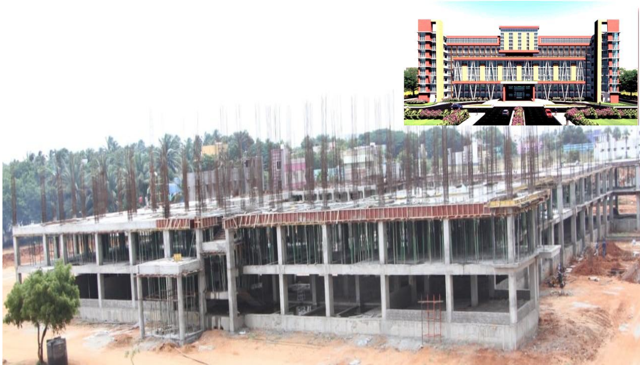
Collectorate Building under construction at Tenkasi