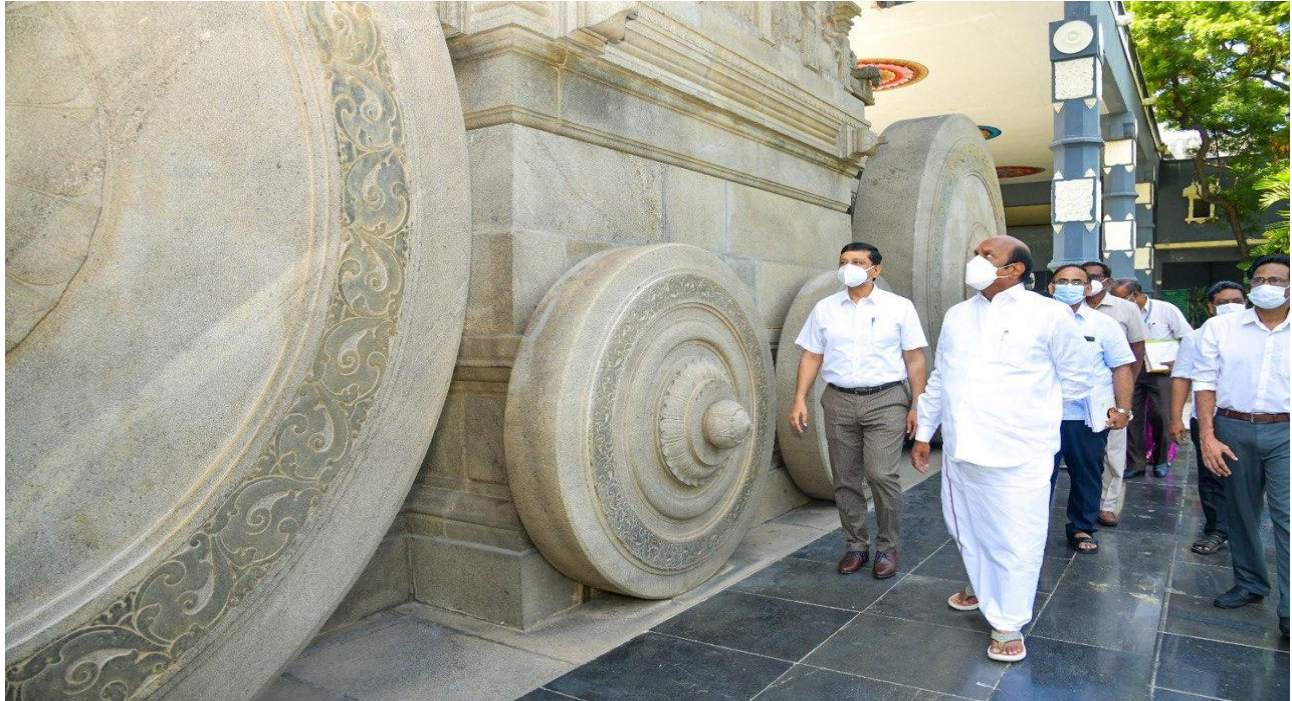
Hon'ble Minister for Public Works inspected the Valluvar Kottam at Chennai on 02.07.2021 for carrying out renovation work