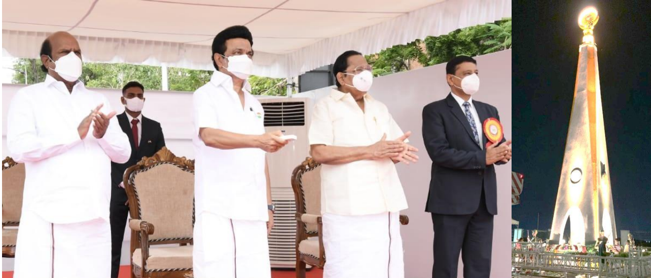
Hon'ble Chief Minister unveiled the 75th Year of Independence of India Commemoration Pillar at Chennai on 15.08.2021