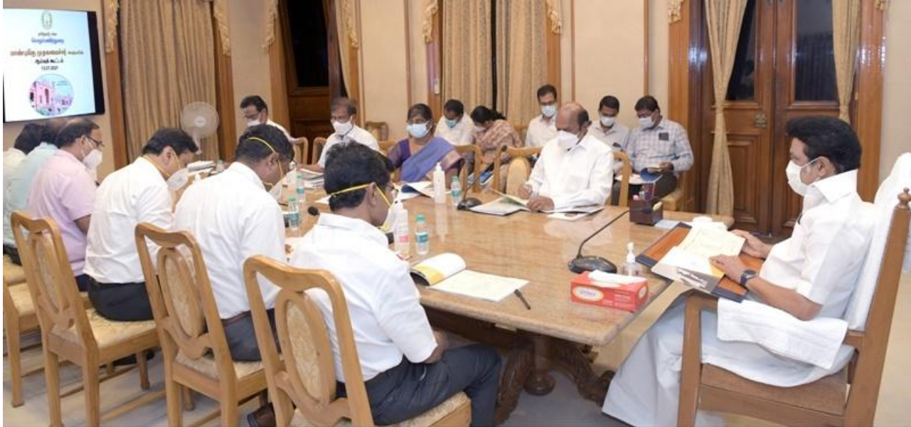
Hon'ble Chief Minister reviewed the activities of Public Works Department on 13.07.2021 at Secretariat, Chennai