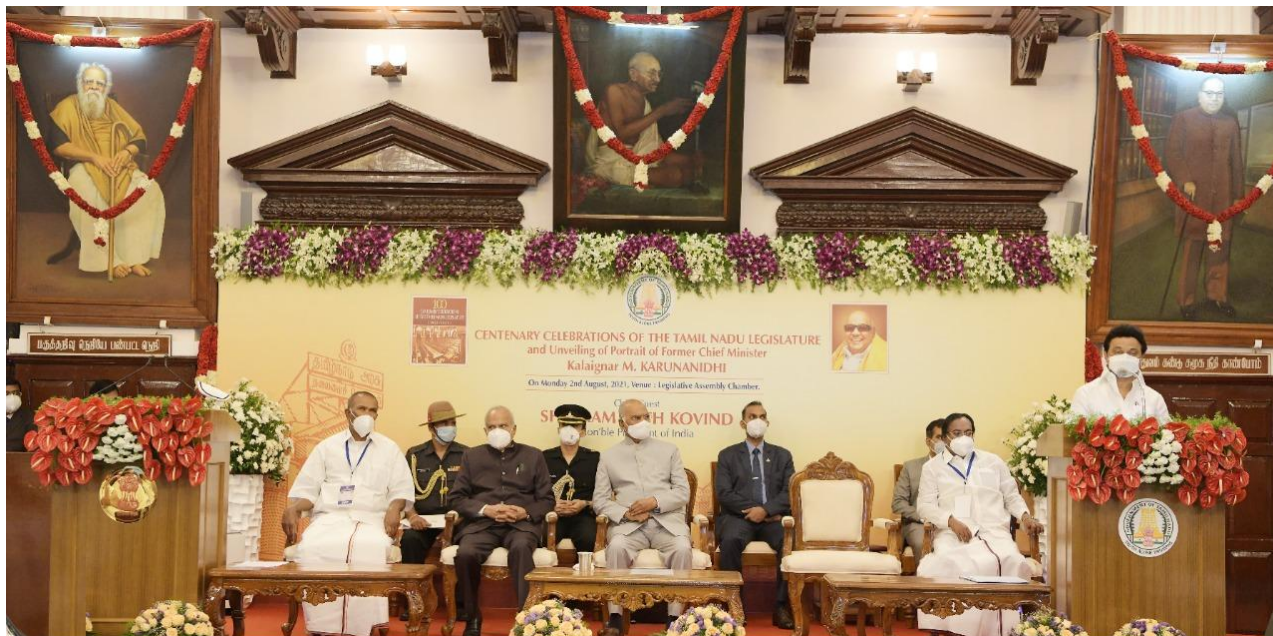
Special Address by Hon'ble Chief Minister during the Centenary Celebrations of the Tamil Nadu Legislature on 02.08.2021