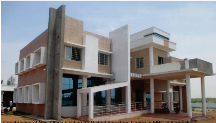
District Industries Centre, Namakkal

3.23.1. Construction of new building for District Industries Centres in 11 places, Additional buildings and renovation for District Industries Centres in 21 places at an estimated cost of Rs.41.42 crore are in progress.