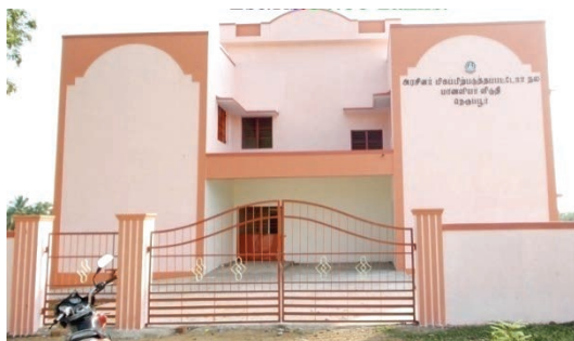
MBC Girls Hostel Building, Neruppur, Dharmapuri District

3.7.2. Renovation of 575 Hostel Building for Backward Classes, Most Backward Classes & Minority Welfare Students at an estimated cost of Rs.25.00 crore are in progress.