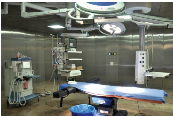
Operation Theatre Multi Super Speciality Hospital