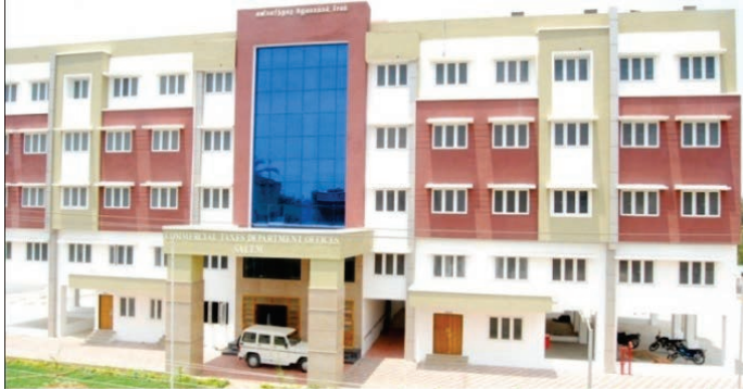
Integrated Commercial Tax Office, Salem