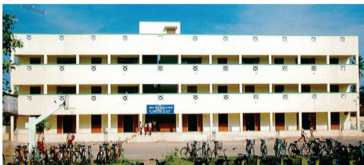
19 Class Room Building, Kuttalam in Nagapattinam District

Out of above, 1147 works have been completed.