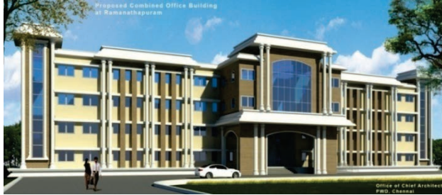
Integrated Office Complex in Master Plan Complex at Ramanathapuram in Ramanathapuram District