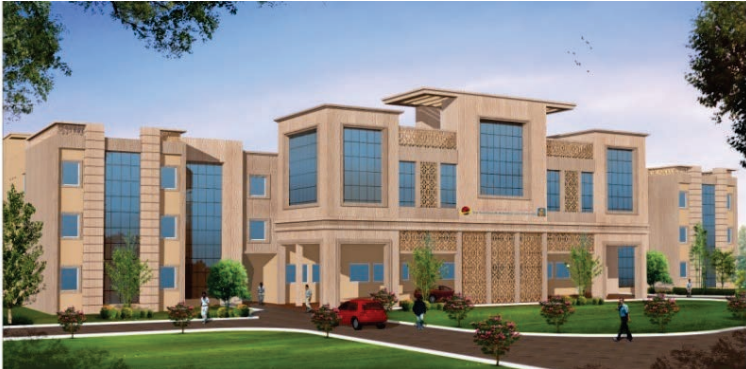
Administrative Block, Tamilnadu Dr. Ambedkar Law University at Perungudi, Chennai