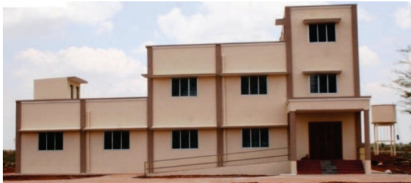
Training Centre at Orathanadu Veterinary Hospital in Eachankottai, Thanjavur District

3.4.4. Construction of building for Training Centre for Farmers at Orathanadu Veterinary Hospital in Eachankottai, Thanjavur District at an estimated cost of Rs.1.56 crore is in progress. The work will be completed by 31.07.2014.