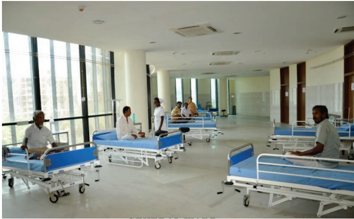
General Ward Multi Super Speciality Hospital