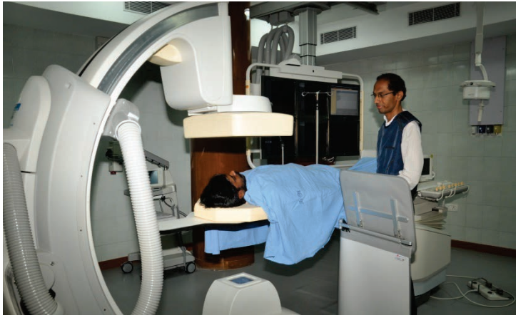
Cath Laboratory Multi Super Speciality Hospital