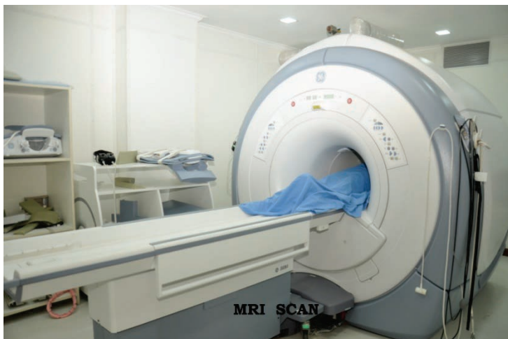
M.R.I. Scan Multi Super Speciality Hospital