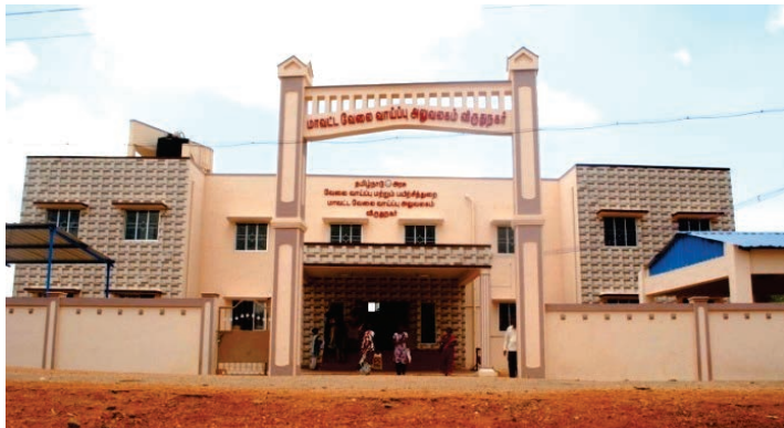
District Employment Office, Virudhunagar

3.15.3. Construction of Integrated Office Building for Labour Welfare Department at Madurai District at an estimated cost of Rs.1.35 crore is in progress. The work will be completed by 30.09.2014.