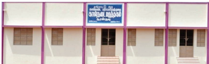
Veterinary Dispensary, Surankudi, Thoothukudi District

3.4.1. An amount of Rs.6.00 crore has been sanctioned for construction of Building for Veterinary Hospital in Kancheepuram, Tiruvallur, Tiruchirappallai, Dharmapuri, Tiruvannamalai, Vellore, Madurai, Tirunelveli, Erode, Salem, Perambalur, Nagapattinam, Villupuram, Ramanathapuram, Thanjavur, Cuddalore, Thoothukudi, Pudukottai and Krishnagiri