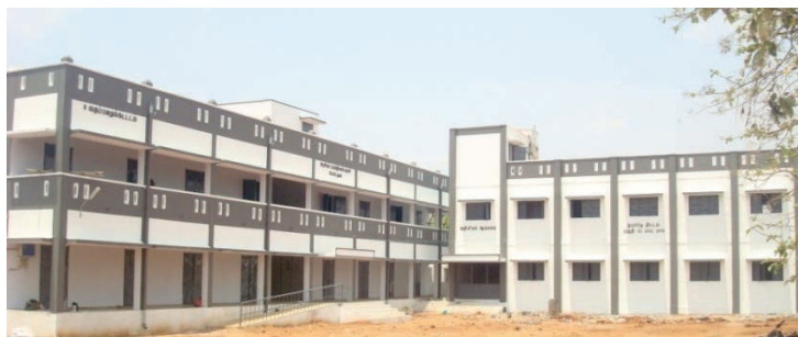
8 Class Room Building, Lab in K.K. Nagar, Salem District