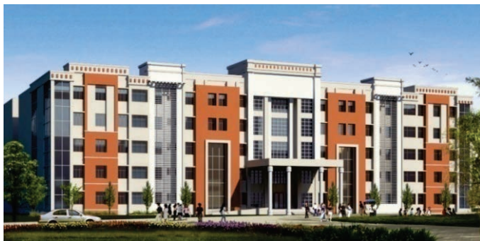
RCH Centre Building at Mohan Kumaramangalam Government Medical College & Hospital, Salem