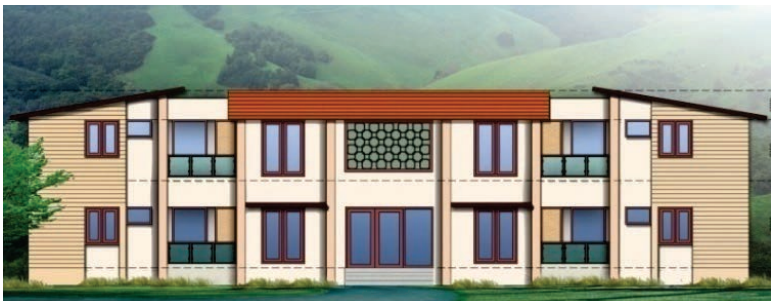
25 Nos. of Staff Quarters at Udhagamandalam in The Nilgiris District