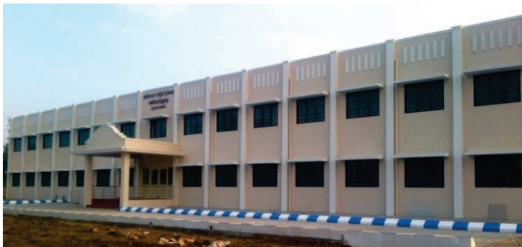
Commercial Tax Department Staff Training Institute, Tiruchirappalli