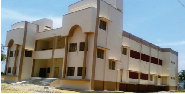
Community Hall, Kudikadu in Cuddalore District

3.9.1. Details of works on the construction of 121 Multipurpose Evacuation Shelters in 12 Coastal Districts in Tamil Nadu under Coastal Disaster Risk Reduction Project with World Bank Assistance at a cost of Rs.294.25 crore are as follows: