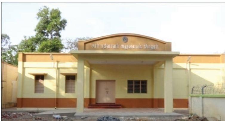
Sub Registrar Office, Omalur, Salem District