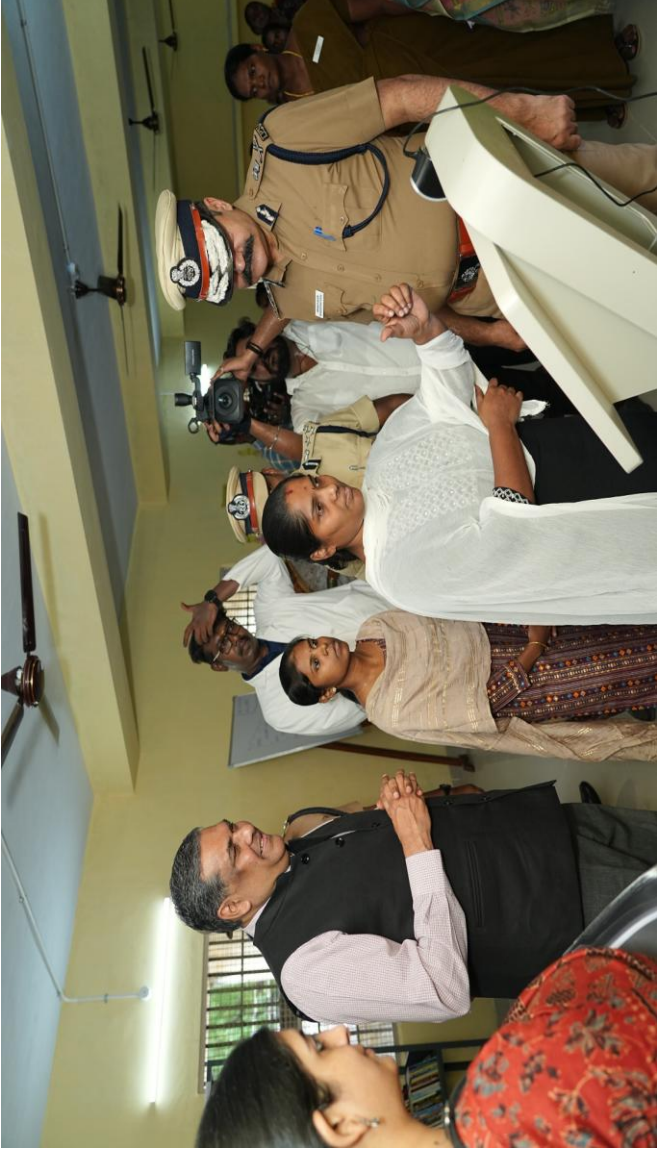
Hon'ble Supreme Court Judge Justice Thiru. Sanjivkhanna on 29.04.2024 viewed the functioning of KIOSK in Prison.