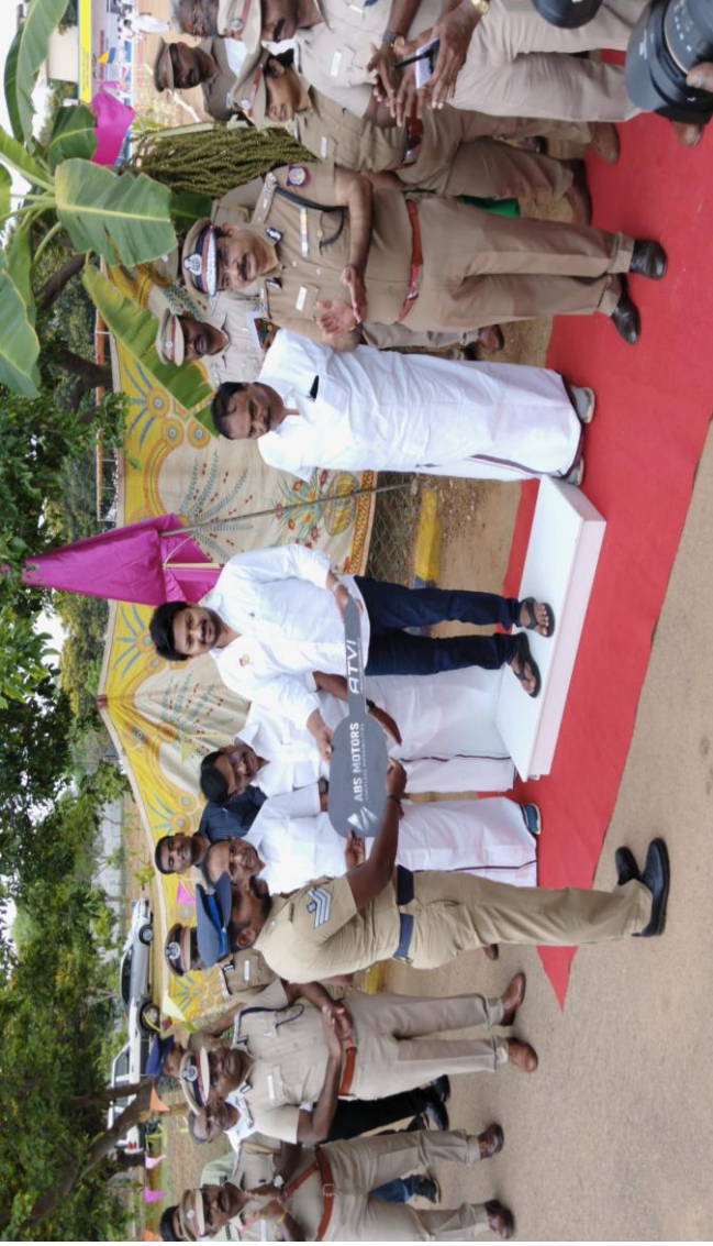
Hon'ble Minister for Youth Welfare and Sports Development Thiru. Udhayanidhi Stalin provided e-cycle to the staff of Central Prison, Puzhal