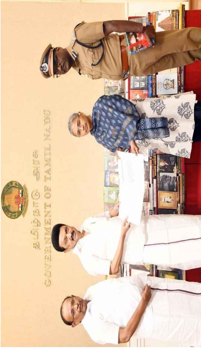
Hon'ble Chief Minister Thiru. M.K. Stalin donated 1500 books to the libraries in all Central Prisons on 28.10.2023.