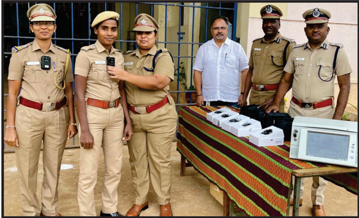
5 numbers of Body Worn Cameras were issued on 08.12.2022 to the Central prison-1, Puzhal for improving the security of Prisons.