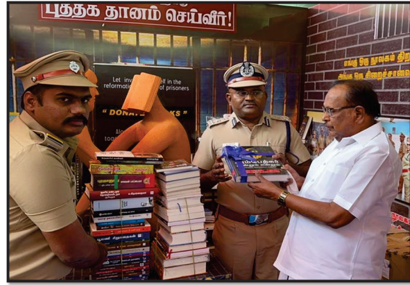
Hon'ble Chief Minister of Tamilnadu on 18.01.2023 and Hon'ble Minister for Law on 19.01.2023 have donated books to the Prison Libraries on the event of 46th Chennai Book Fair.