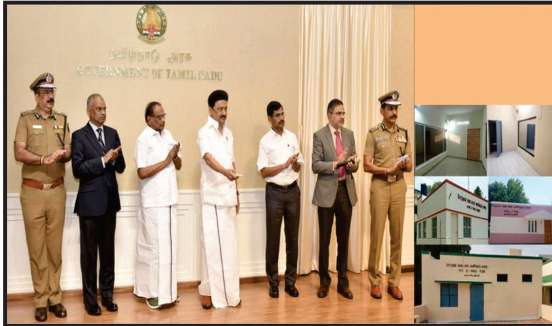
Hon'ble Chief Minister of Tamil Nadu has inaugurated the “Test Identification Parade Room” in 12 District Jails premises on 25.11.2022 .