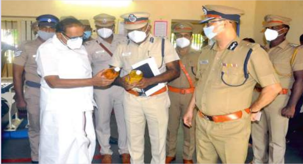
The Hon'ble Minister for Law visit the Cold Pressed Oil Unit at Central Prison-II, Puzhal on 10.05.2021.