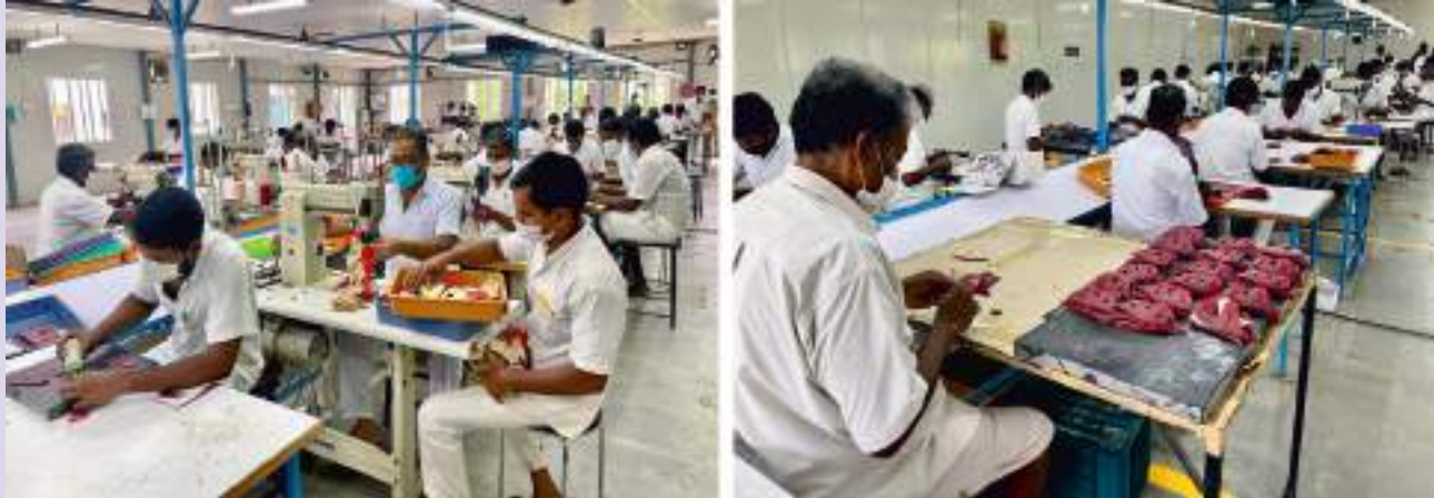
Convict prisoners are engaging in the Shoe Making Industry under Public Private Partnership Scheme at Central Prison-I (Convict), Puzhal.