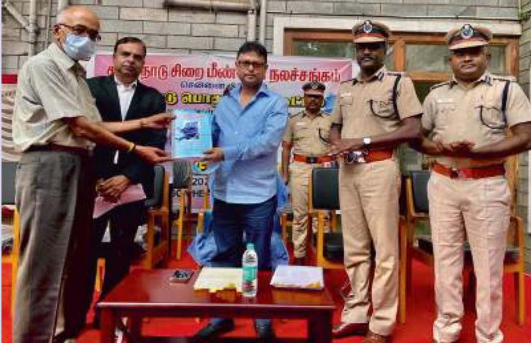
Annual General body Meeting of the Tamil Nadu Discharged Prisoners' Aid Society was held on 10.12.2021 in the Office of the Director General of Police/Director General of Prisons & Correctional Services, Egmore, Chennai-8.