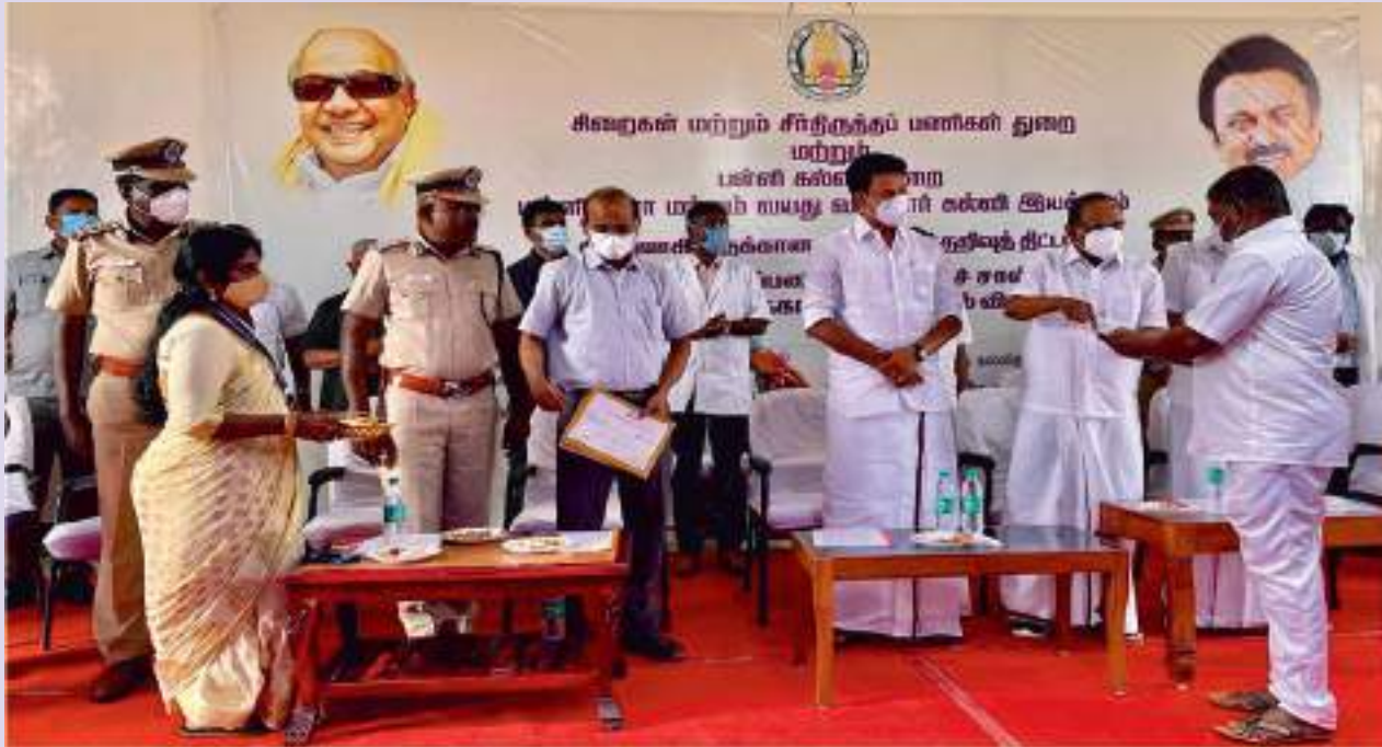
Adult Education and Special Literacy Mission Certificates & Library Books were issued to the inmates of Central Prison-I, Puzhal by the Hon'ble Ministers for Law and School Education Departments on 05.01.2022.