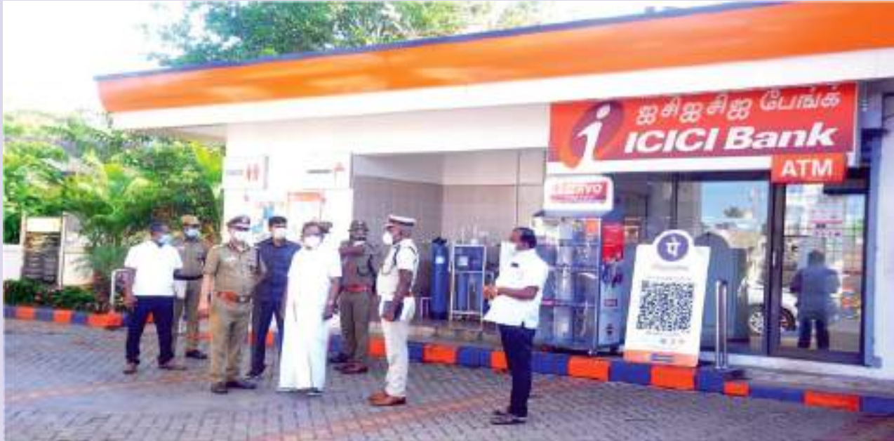
The Hon'ble Minister for Law visit the Petrol Bunk run by the Department of Prisons and Correctional Services at Central Prison Campus, Puzhal on 10.05.2021.