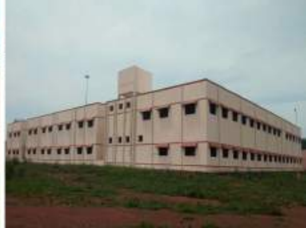
Construction of Additional Block at a cost of Rs.15,05,84,000/- in Central Prison-II, Puzhal to accommodate 500 prisoners.