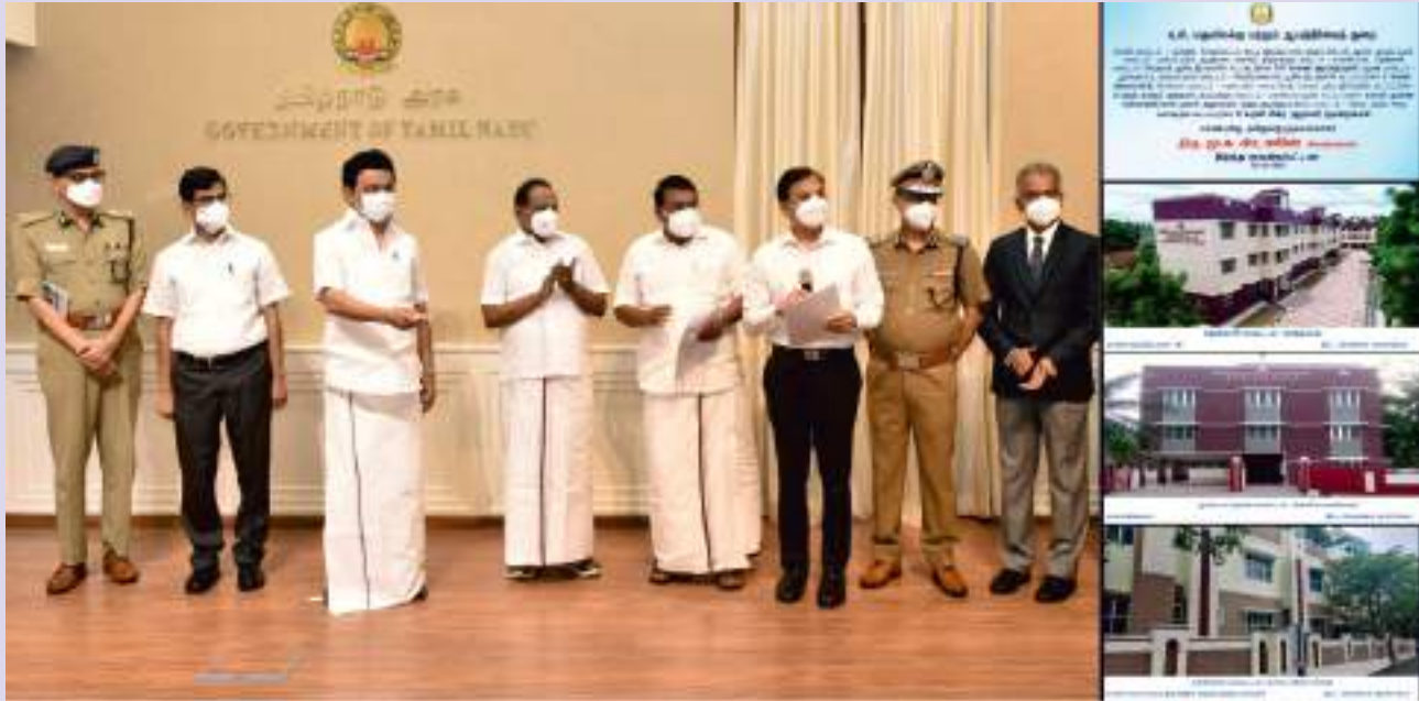
On 20.11.2021, the Hon'ble Chief Minister inaugurated newly constructed 6 quarters for Assistant Jailer at Central Prison Campus, Coimbatore at a cost of Rs.127.97 lakh.