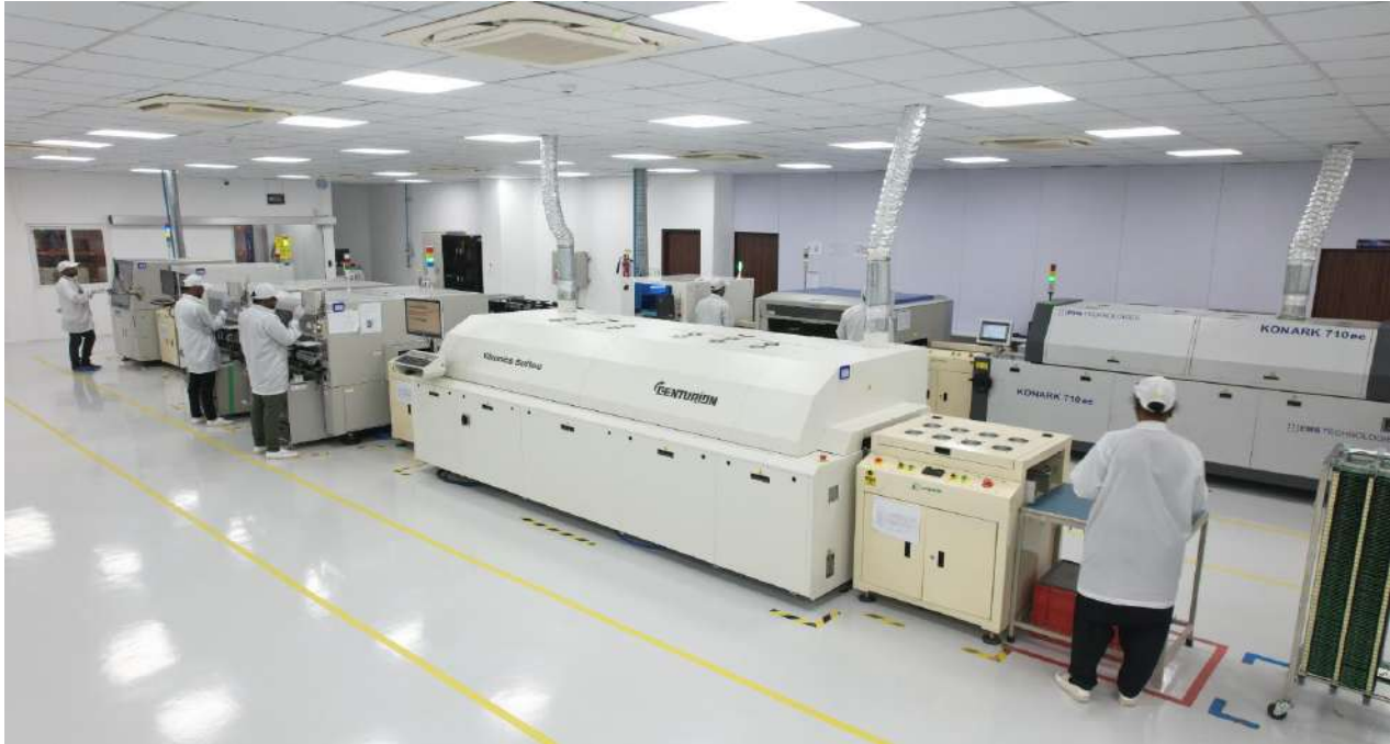
Printed Circuit Board manufacturing unit assisted with Capital subsidy of Rs.120.92 lakh in Chengalpattu District.