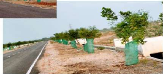
New Industrial Estate at Manapparai in Trichy District.