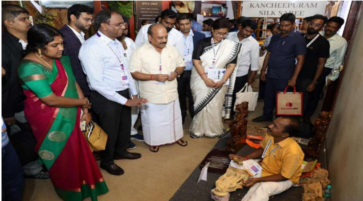
Hon'ble Minister for MSME visited the GI Tag Products pavilion in Tamil Nadu Global Investor Meet-2024.