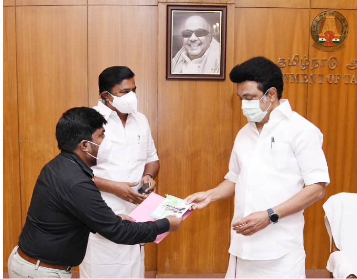
Hon'ble Minister for Information and Publicity presented the Special Publication of Tamilarasu to the Hon'ble Chief Minister of Tamil Nadu Thiru. M.K. Stalin (Chennai, 08.07.2021).