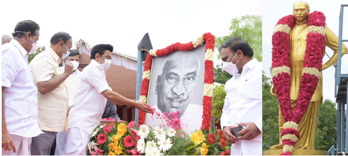
Hon'ble Chief Minister of Tamil Nadu Thiru. M.K. Stalin paid floral tributes to the portrait of Perunthalaivar Kamarajar (Chennai, 15.07.2021).