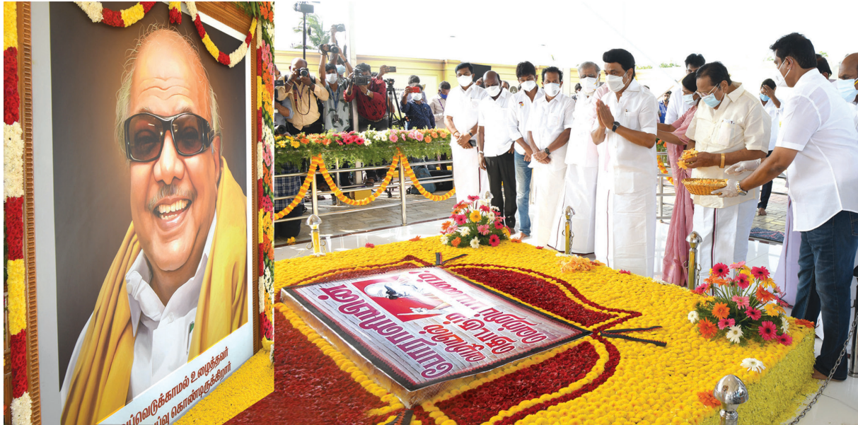
Hon'ble Chief Minister of Tamil Nadu Thiru. M.K. Stalin paid floral tributes at the memorial of Muthamizh Arignar Dr. Kalaigñar (Chennai, 03.06.2021).