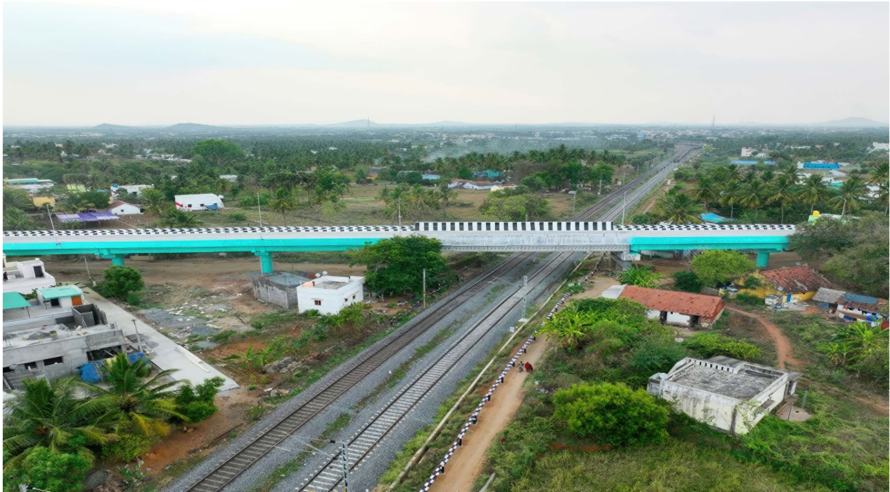
Road over Bridge in lieu of LC-7 at Omalur-Muthunaickenpatti-Salem District