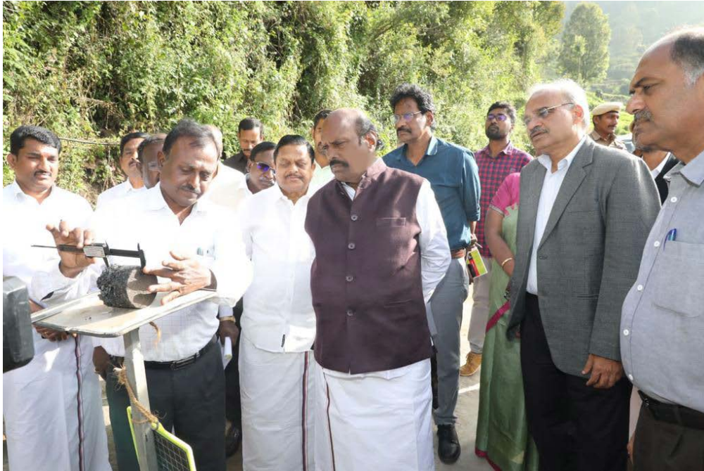
Hon'ble Minister for Public Works,Highways and Minor Ports inspected the quality of Chinna Coonoor- Ebbanad road-The Nilgiris District