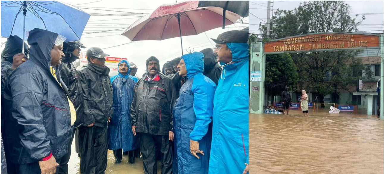
Hon'ble Minister for Public Works, Highways and Minor Ports inspected the flood affected GST road at Chromepet near Government General Hospital- Chengalpattu District