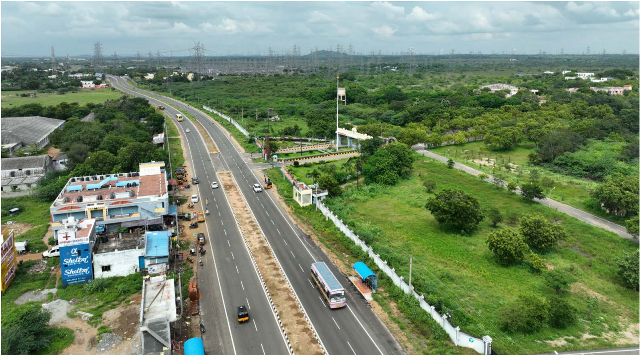
Four-laning of Tirunelveli – Sengottai – Kollam road.