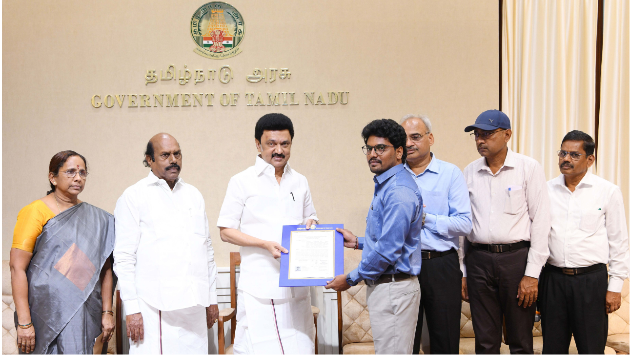
Hon'ble Chief Minister handed over Appointment orders to Junior Drafting Officers on 8.3.2024.