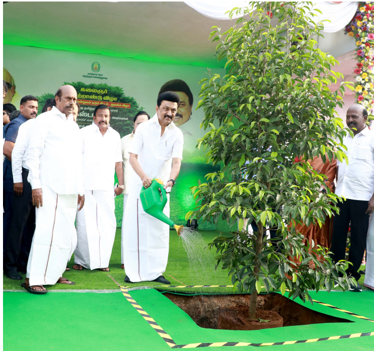
Hon'ble Chief Minister inaugurated the 5 lakh tree saplings planting Ceremony at HRS campus, Chennai on 7.6.2023.