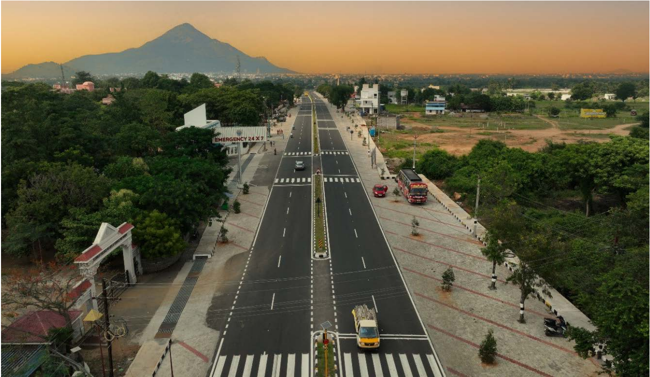
Four laning of Cuddalore – Chittoor road.