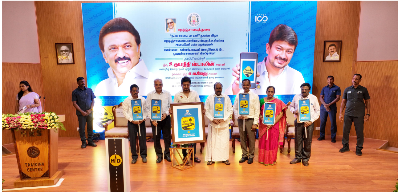
In the presence of Hon'ble Minister for Public Works, Highways and Minor Ports, Hon'ble Minister for Youth Welfare and Sports Development launched the "Namma Saalai app" for Highways Department on 1.11.2023