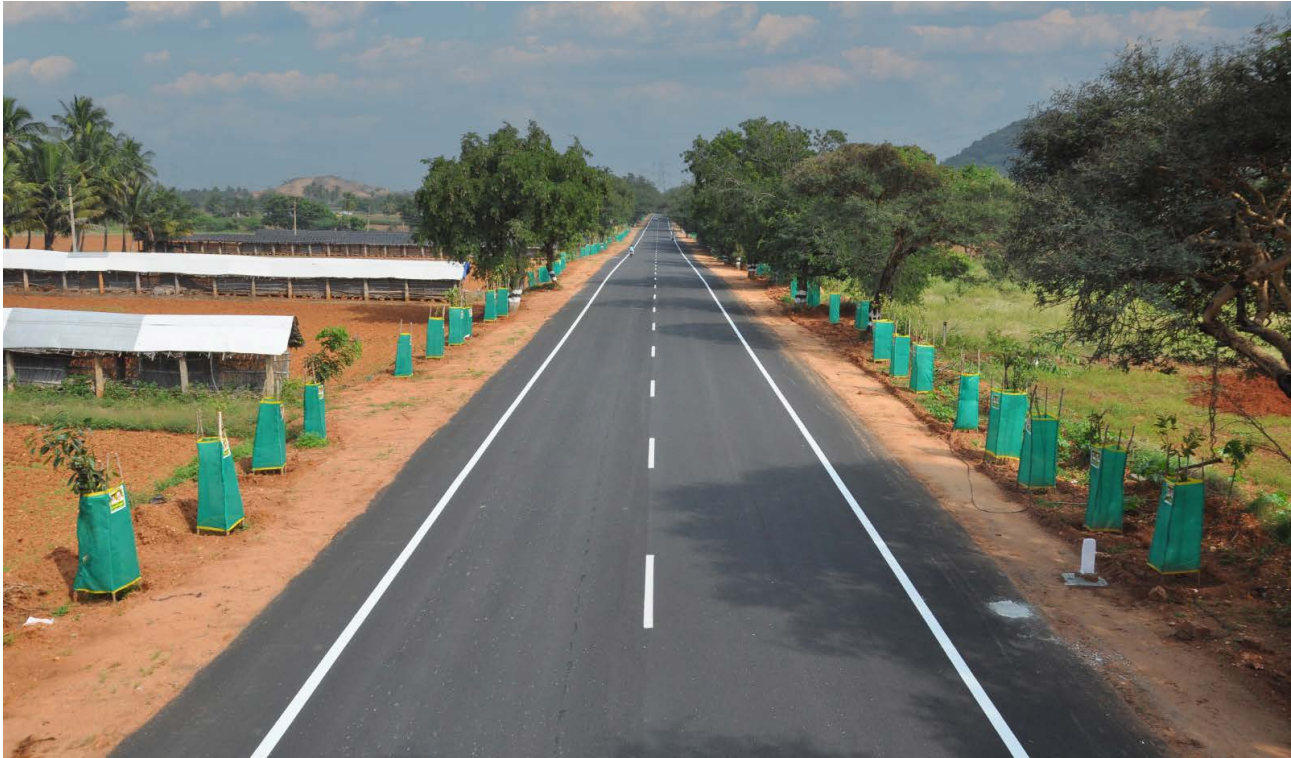
Tree saplings planted along Vadamadurai-Ottanchathiram road