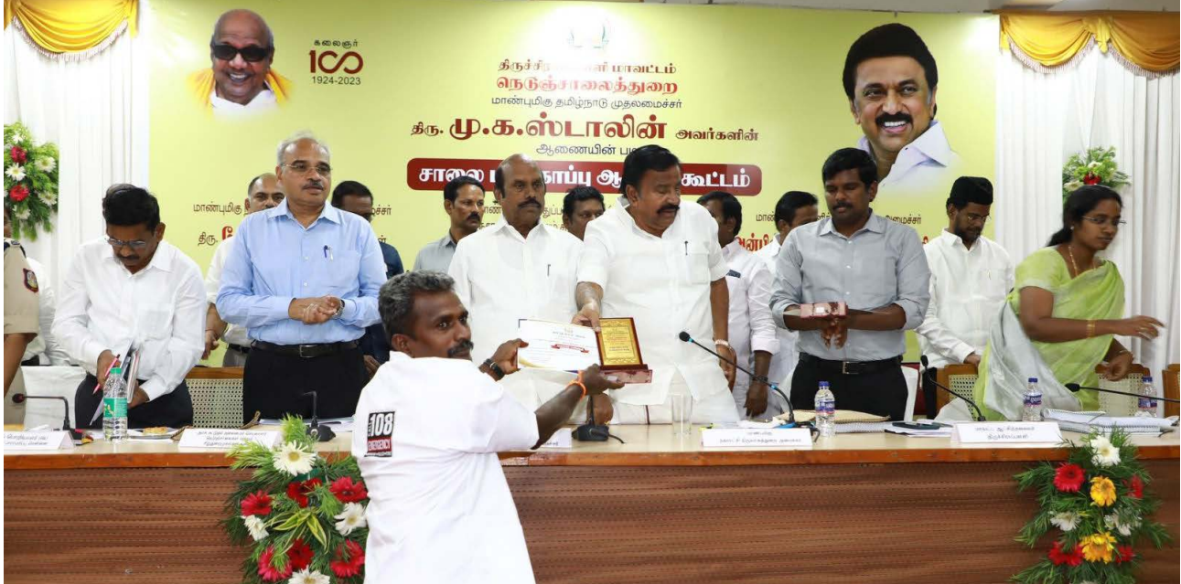
Hon'ble Minister for Municipal Administration, Urban and Water Supply and Hon'ble Minister for Public Works, Highways and Minor Ports conducted a Road safety review meeting on 8.7.2023 in Trichy District.