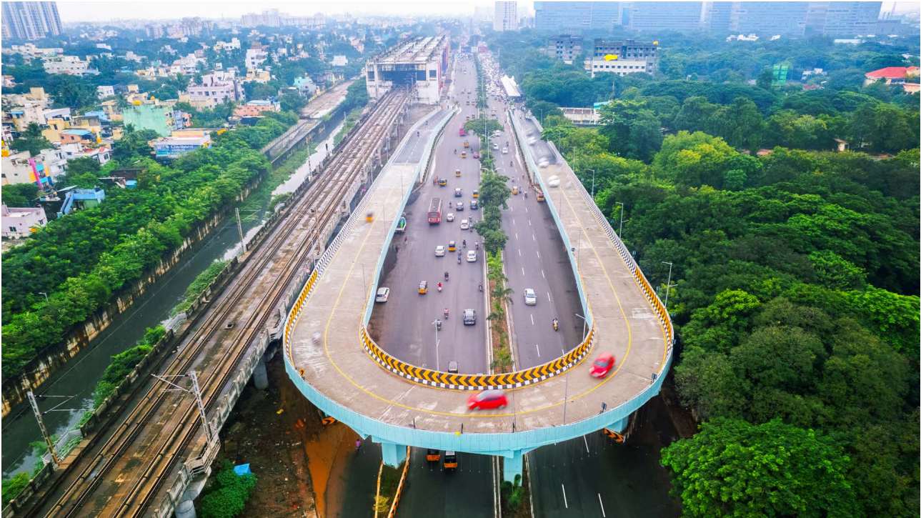
Hon'ble Chief Minister inaugurated Indira Nagar 'U' Shaped fly over at Rajiv Gandhi Salai (OMR), Chennai on 23.11.2023.