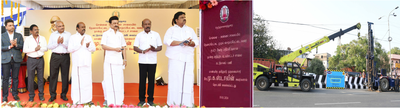
Hon'ble Chief Minister laid Foundation stone for the Construction of Elevated Corridor from Teynampet - Saidapet at Anna Salai, Chennai on 19.1.2024.