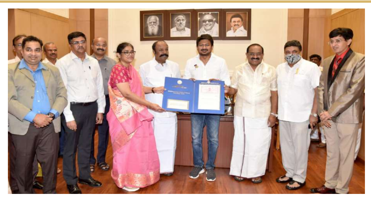
Hon'ble Minister for Youth Welfare and Sports Development launched the scheme of issue of duplicate family cards through post.