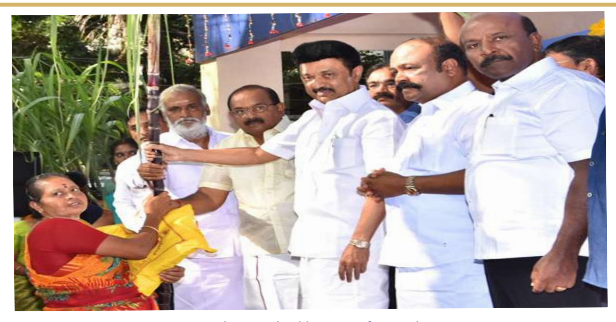
"உழுவார் உலகத்தார்க்கு ஆணி அஃதாற்றாது எழுவாரை எல்லாம் பொறுத்து"

The Hon'ble Chief Minister of Tamil Nadu has Inaugurated the scheme of Pongal Gift Hampers with Rs.1000/- cash to all the Rice Card Holders on 10.01.2024