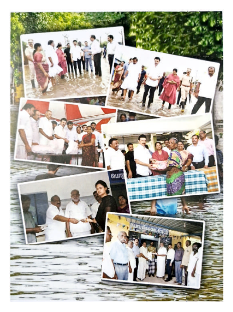
"Hon'ble Chief Minister's Relief to people affected by rain and flood". Hon'ble Minister for Rural Development and Hon'ble Minister for Food and Civil Supplies distributing 5 kg of rice in addition to Rs. 6000/in Thoothukudi District.