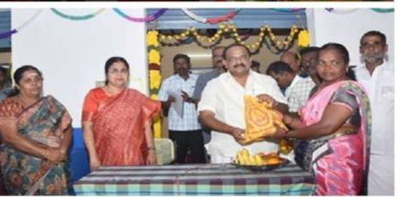
2009 new full-time and part-time Fair Price Shops were opened since the assumption of power by the Hon'ble Chief Minister