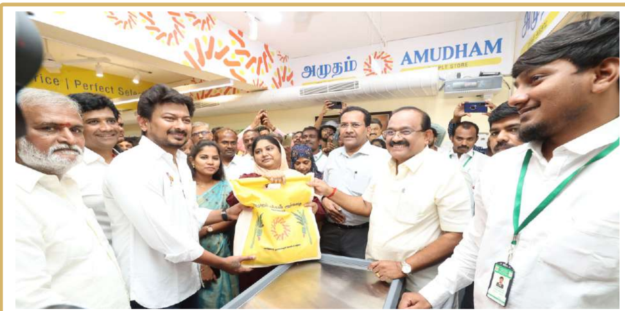
'பொதுமக்கள் சேவையில் அமுதம் மக்கள் அங்காடி'

The Hon'ble Minister for Youth Welfare and Sports Development has inaugurated the Modernized Amudham Shop at Gopalapuram and initiated the sale on 08.07.2023