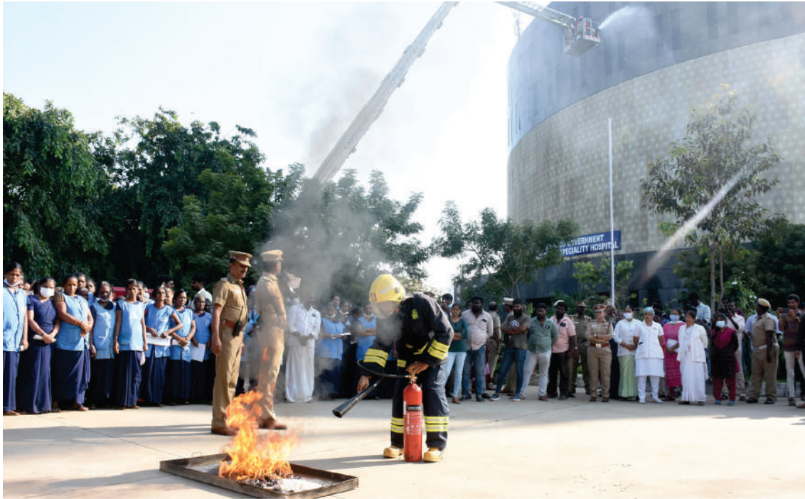
FIRE PREVENTION MOCK DRILL CONDUCTED IN MULTI SUPER SPECIALTY HOSPITAL