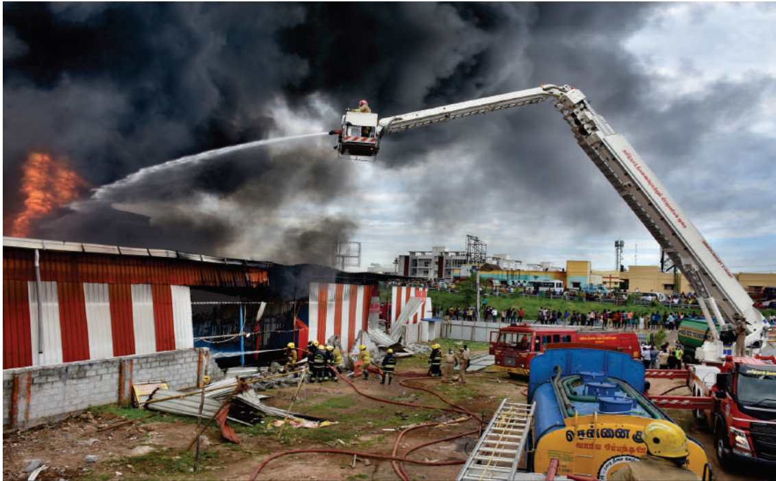
FIRE FIGHTING IN A FILM DECORATIONS WAREHOUSE