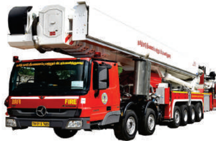
AERIAL LADDER PLATFORM