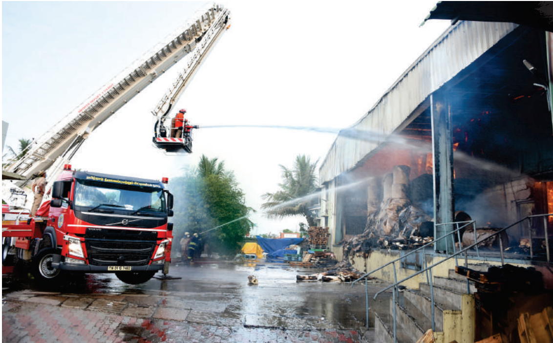
FIRE FIGHTING IN A PAPER GODOWN