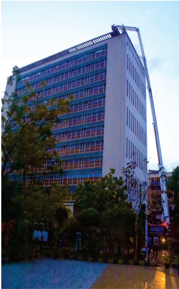
FIRE FIGHTING IN LIC BUILDING