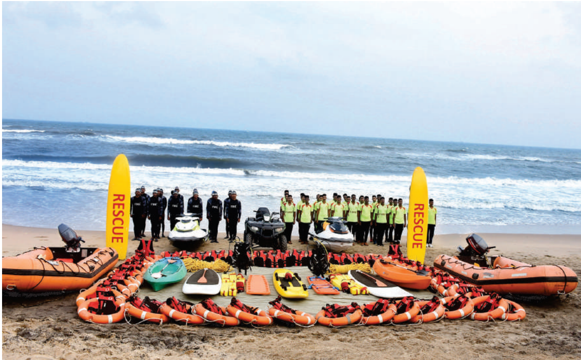
RESCUE TEAM - MARINA BEACH, CHENNAI