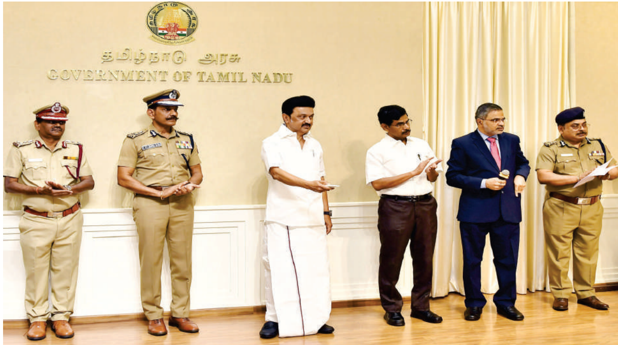
THE HON'BLE CHIEF MINISTER INAUGURATED THE NEW FIRE AND RESCUE SERVICES STATIONS ON 10.04.2023.