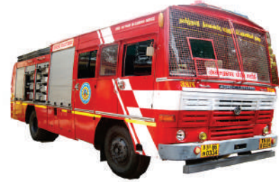
EMERGENCY RESCUE TENDER