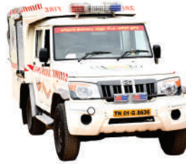
QUICK RESPONSE VEHICLE