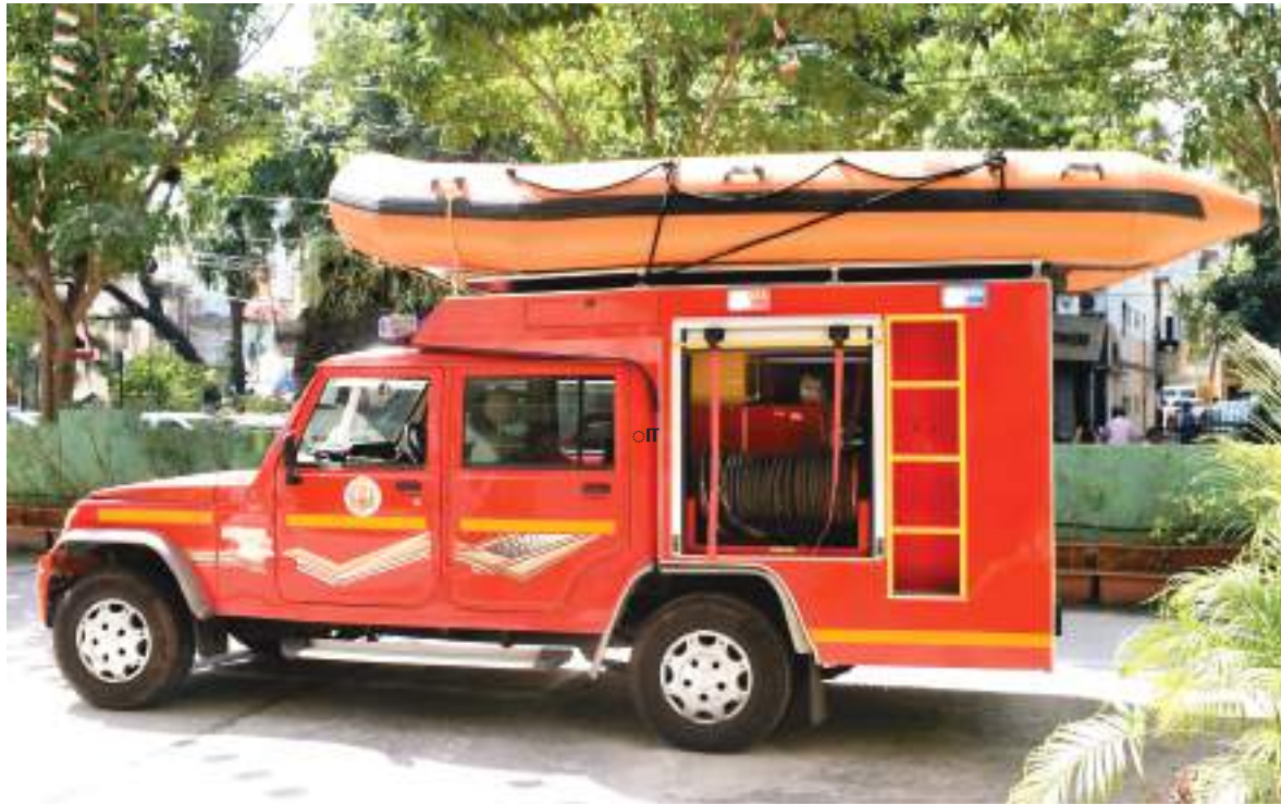
QUICK RESPONSE VEHICLE WITH INFLOATABLE RUBBER BOAT