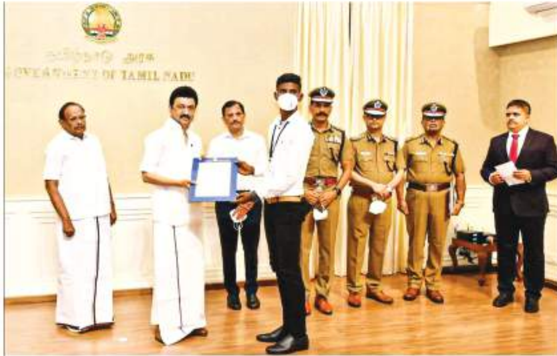
HON'BLE CHIEF MINISTER PRESENTED THE APPOINTMENT ORDER TO THE FIREMAN