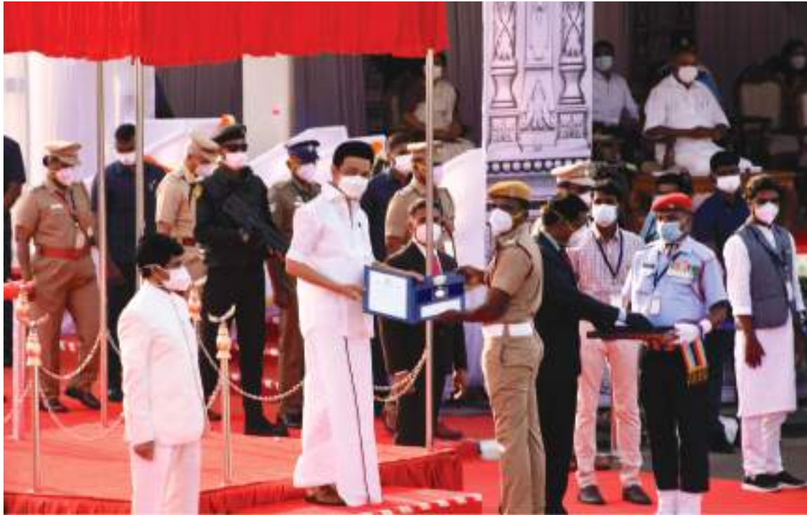
HON'BLE CHIEF MINISTER PRESENTED ANNA MEDAL TO THE FIREMAN