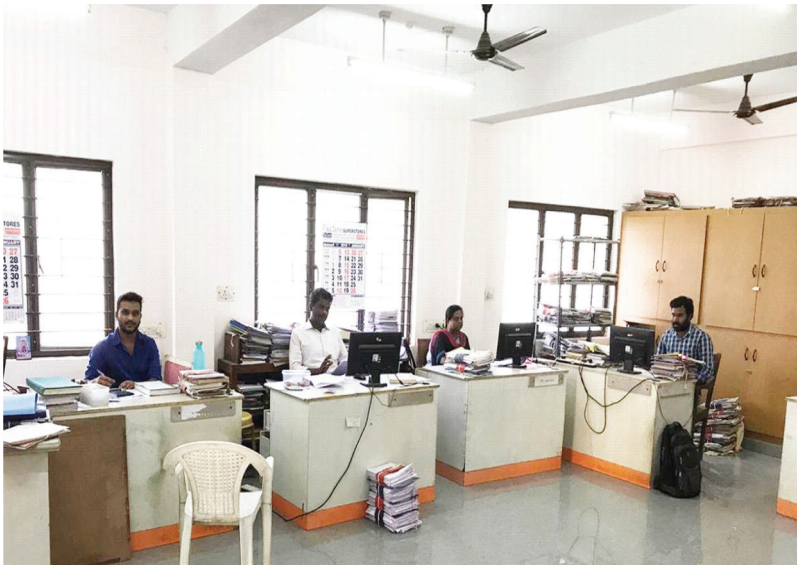
Officers working in Krishnagiri Commercial Tax Office