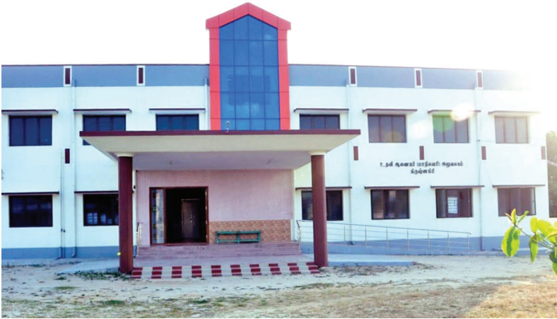
Commercial Tax Office Building at Krishnagiri inaugurated by the Hon'ble Chief Minister