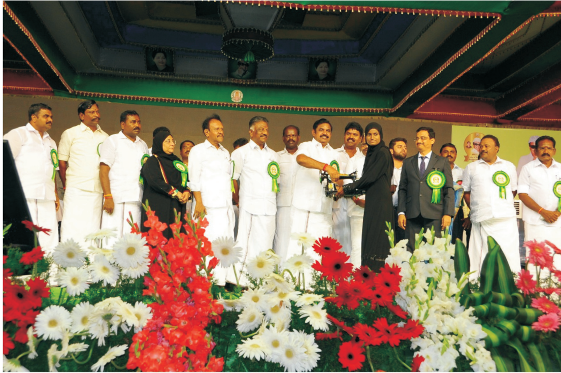
Hon'ble Chief Minister distributes sewing machines to beneficiaries