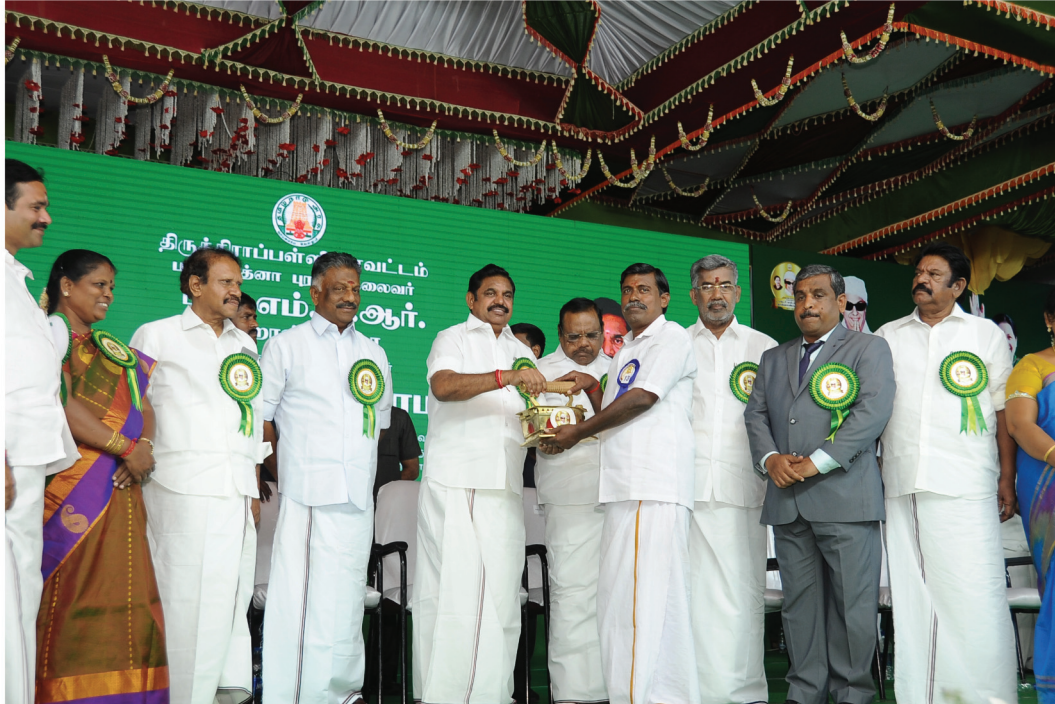
Hon'ble Chief Minister distributes iron boxes to beneficiaries