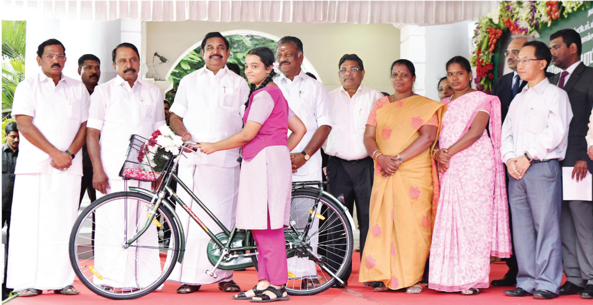
Hon'ble Chief Minister inaugurated the scheme of distribution of bi-cycles on 23.12.2019.