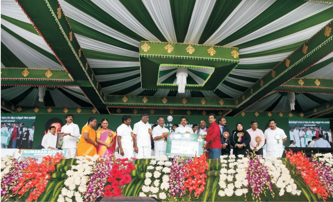
Hon'ble Chief Minister distributes loan assistance to beneficiaries under General Term Loan scheme of Tamil Nadu Minorities Economic Development Corporation