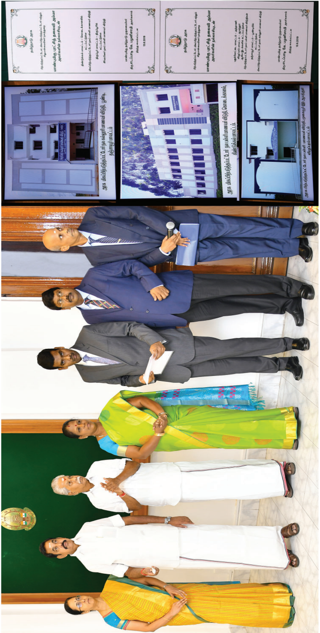
Hon'ble Chief Minister has inaugurated the newly constructed School and College Hostel Buildings on 13.06.2019