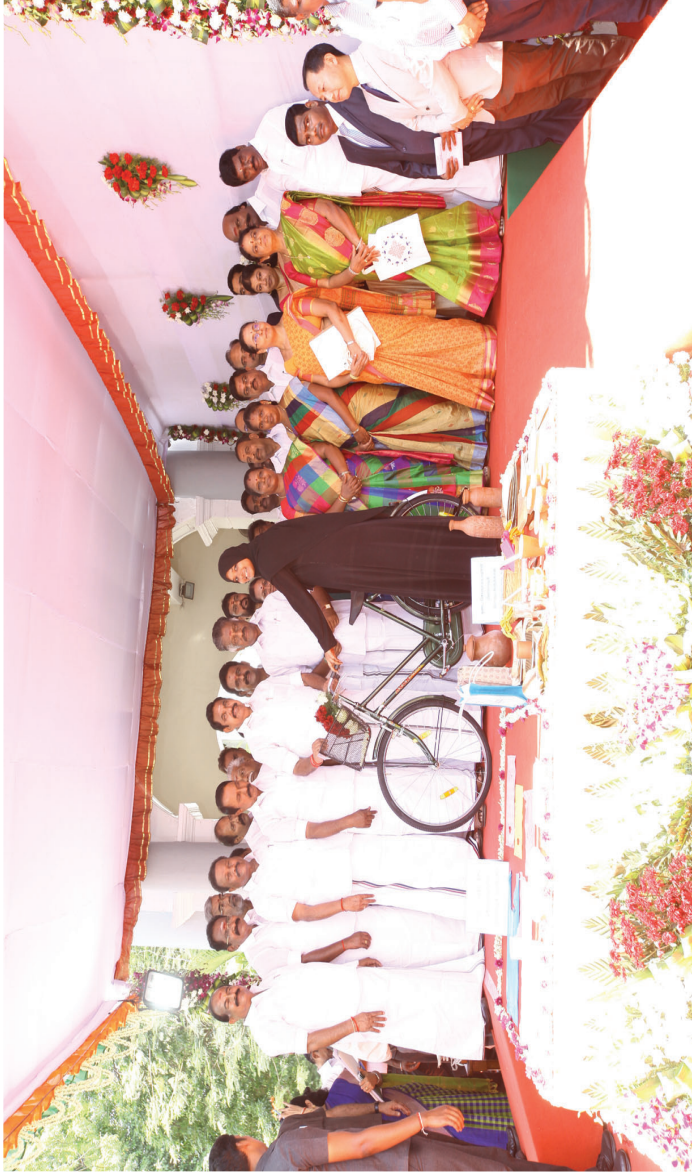
Hon'ble Chief Minister inaugurated the scheme of distribution of bi-cycles on 23.08.2018