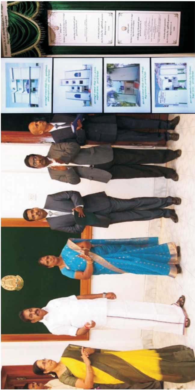
Hon'ble Chief Minister has inaugurated the newly constructed School and College Hostel Buildings on 01.03.2018