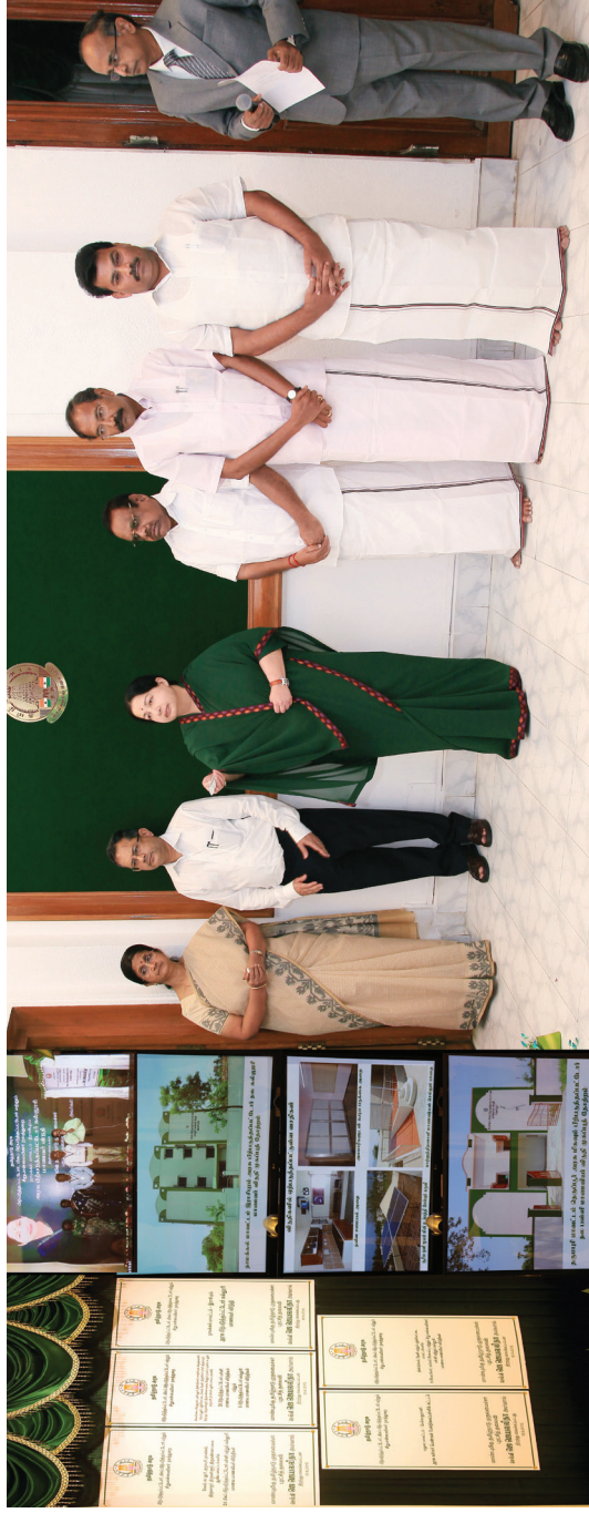
Hon'ble Chief Minister on 12.06.2015 inaugurated 80 newly constructed Backward Classes, Most Backward Classes, Denotified Communities and Minorities Hostels and Checkanurani Kallar Reclamation Girls Higher Secondary School Building