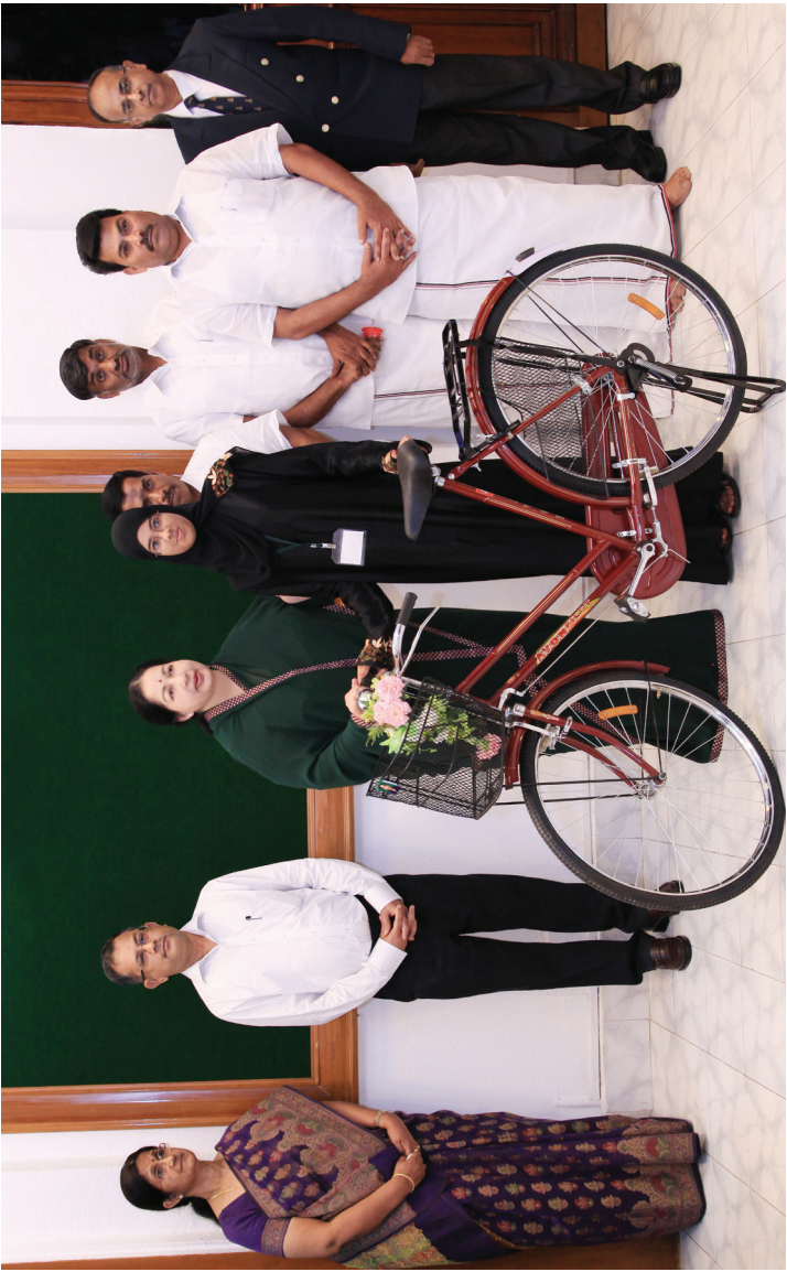
Hon'ble Chief Minister on 15.07.2015 inaugurated the scheme of distribution of bi-cycles to 11th Std Students for the academic year 2015-16