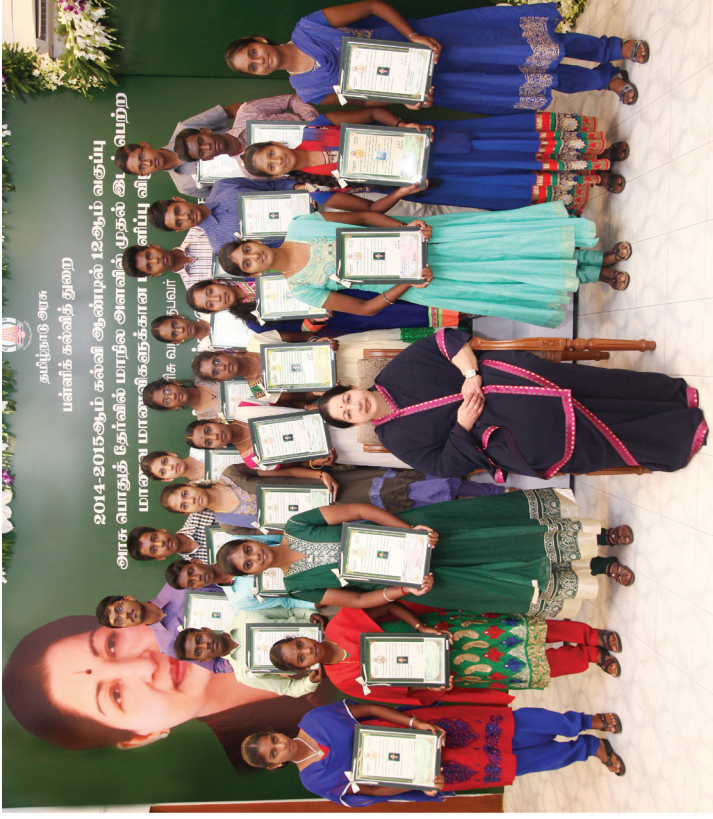
Hon'ble Chief Minister on 29.06.2015 has awarded prizes to the Students who secured First Rank in 12th Std Public Examination at the State Level